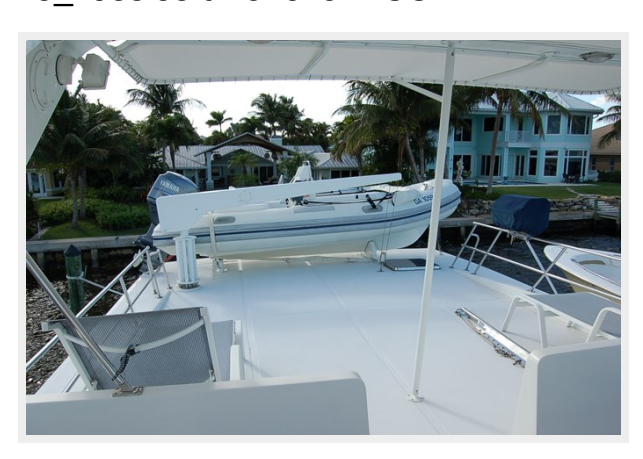
5_1988 53ft DeFever POC MEANDER