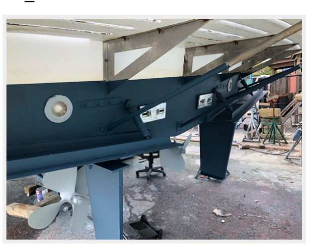
32_1988 53ft DeFever POC MEANDER