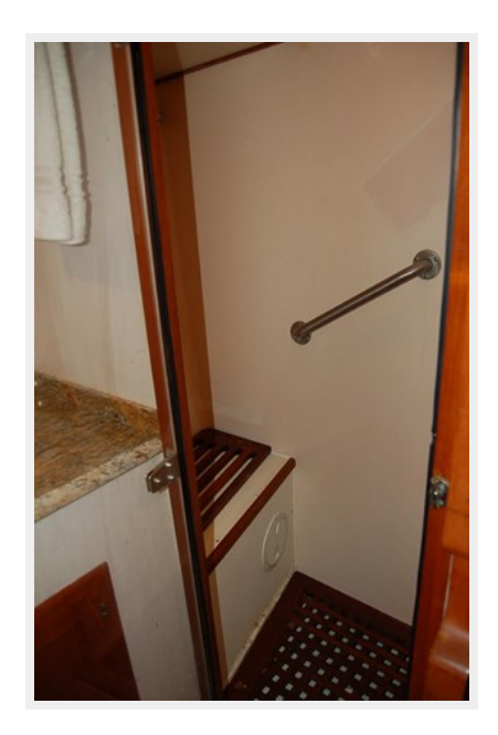
23_1988 53ft DeFever POC MEANDER