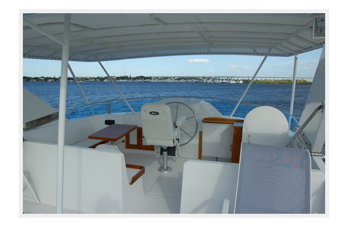
4_1988 53ft DeFever POC MEANDER