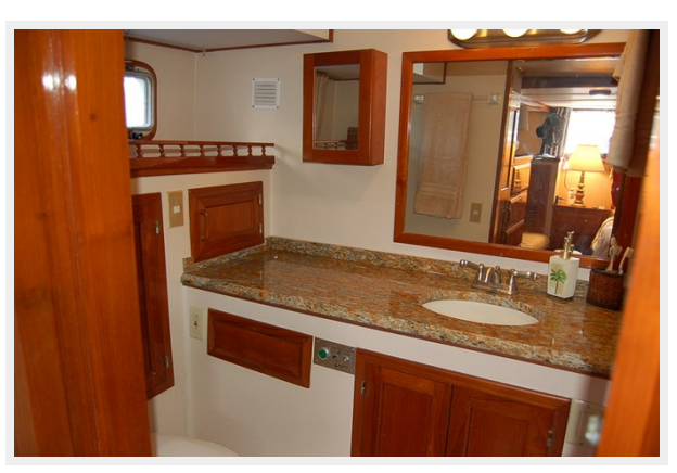
16_1988 53ft DeFever POC MEANDER