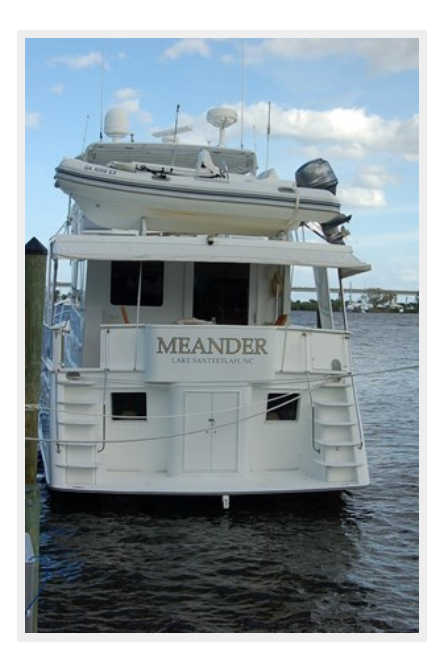
3_1988 53ft DeFever POC MEANDER