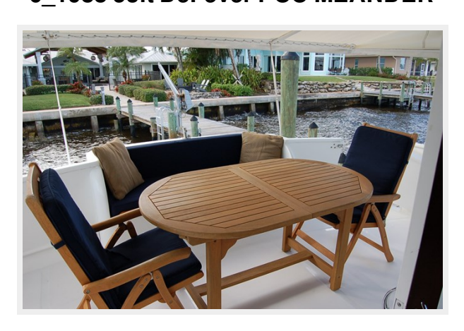
6_1988 53ft DeFever POC MEANDER