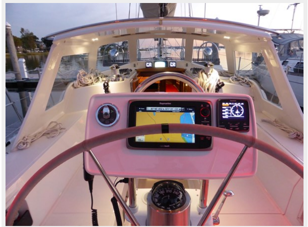
Hard dodger viewed from helm