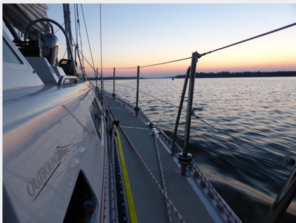
Red skies at night sailors delight