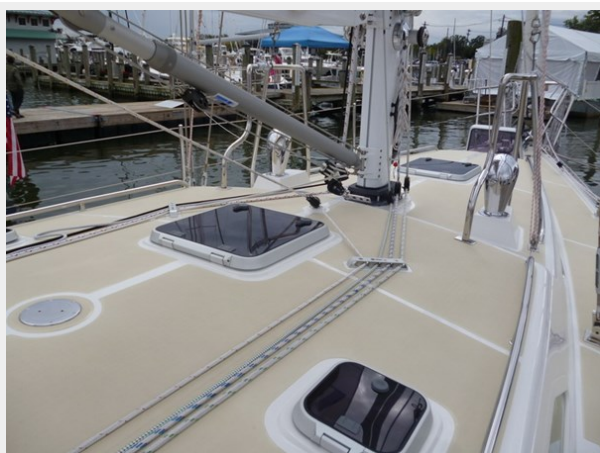
Cabin top looking forward