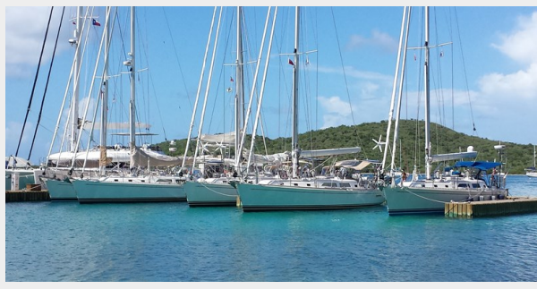
Five Outbound 46's in BVI - Salty Dawg Rally