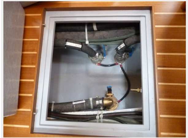
Thru hulls at companionway