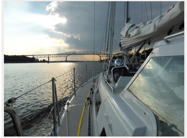
Hard dodger and side deck at dusk