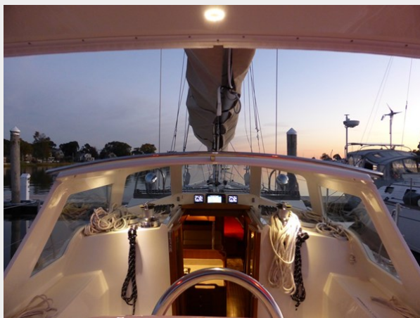
Hard dodger at dusk