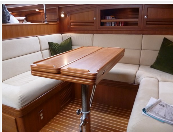
Salon table closed