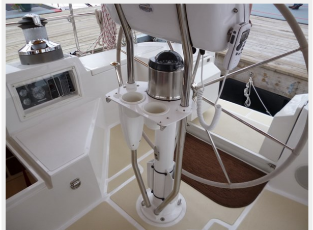
Helm and engine controls