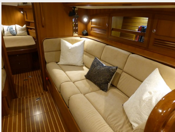
Starboard settee looking forward