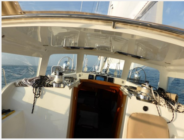
Sightline through hard dodger under sail