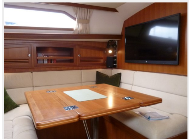
Salon table open