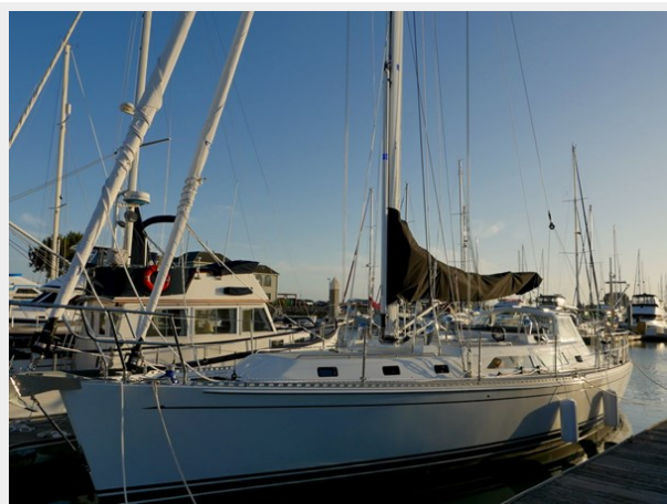
At the dock