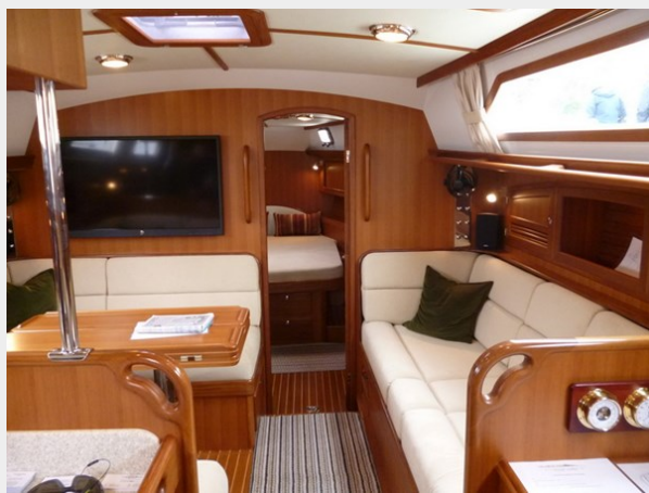
Salon looking forward