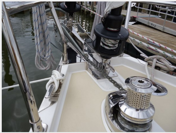
Double bow roller and windlass