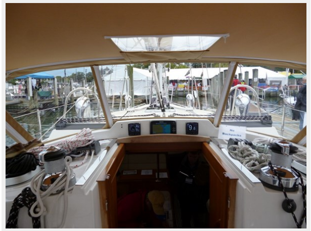
Soft Dodger option