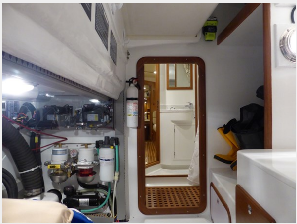
View forward in workshop