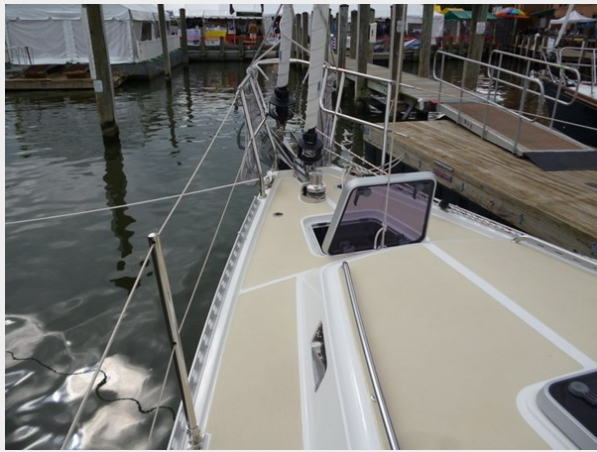
Recessed forward deck hatch