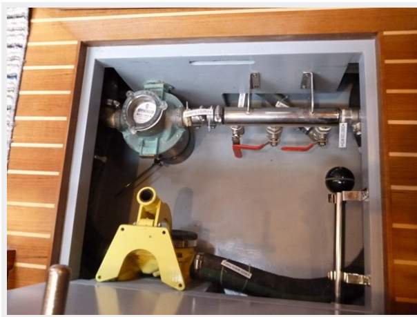
Manual bilge pump and sea water manifold