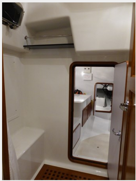
Door to workshop