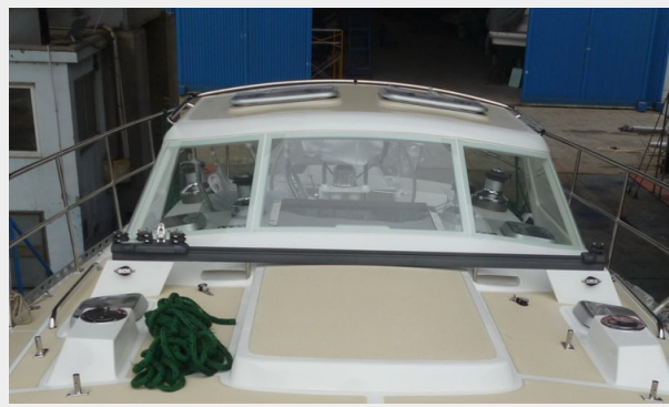
Hard Dodger at factory