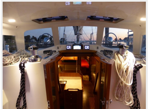
LED lights under hard dodger