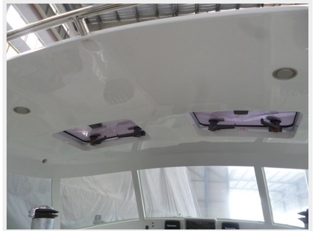
Hatches and LED lights on hard dodger