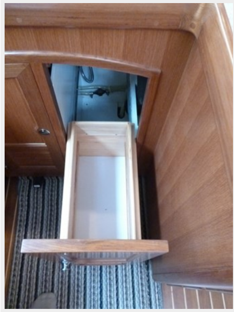
Slide out trash in galley