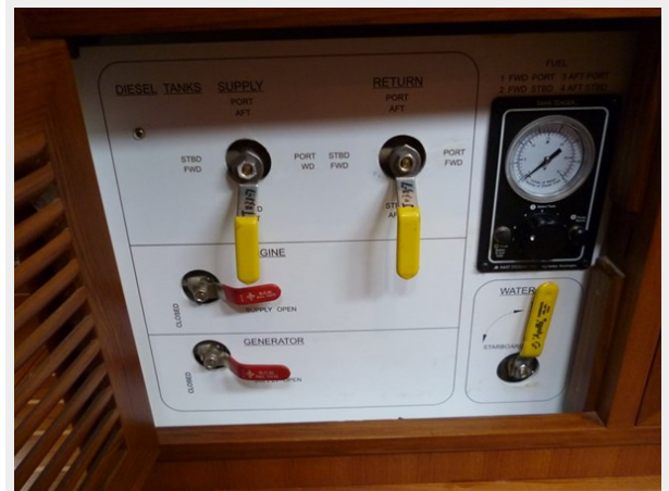
Fuel and water manifolds