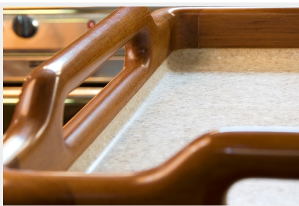
Hand hold in fiddle and counter detail