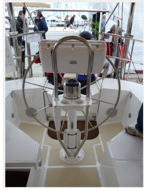
Helm looking aft