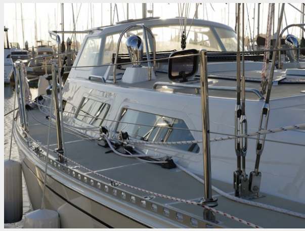
Wide side decks