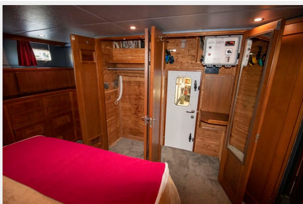
Master Aft Closets Open