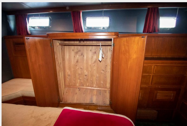
Master Starboard Closet Open