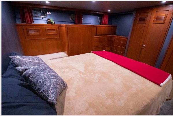
Master King Starboard Aft