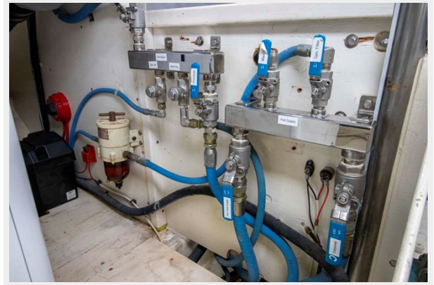
Port Fuel Manifold