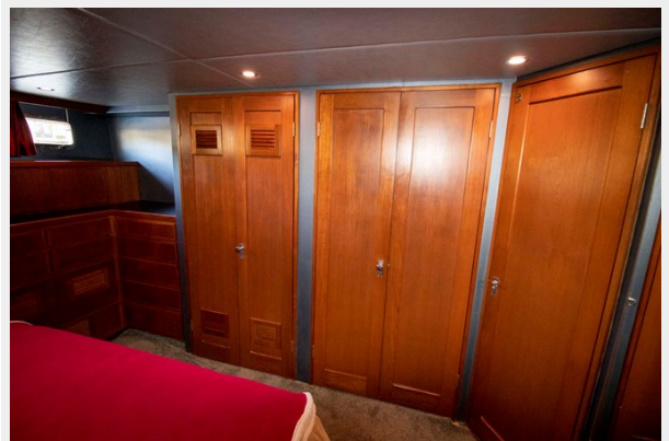
Master Aft Closets Closed