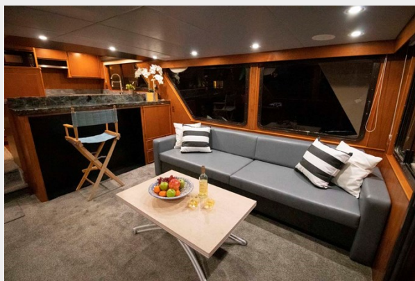
Salon Starboard Forward