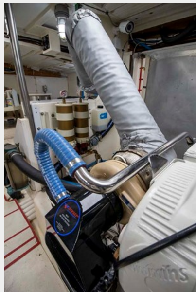
Port Main Aft