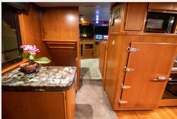
Galley Looking at Pilothouse