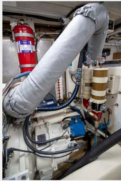
Starboard Main Aft