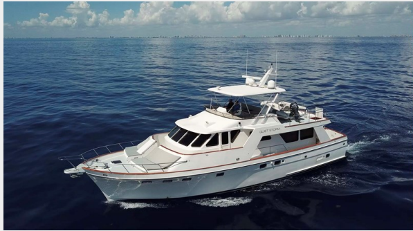
Above Port Bow