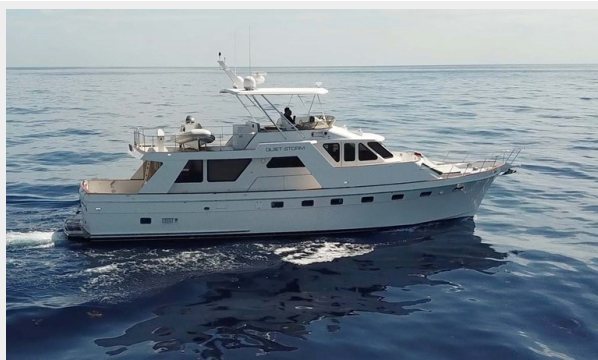
Running Starboard Beam