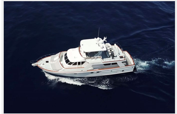
Above Port Side