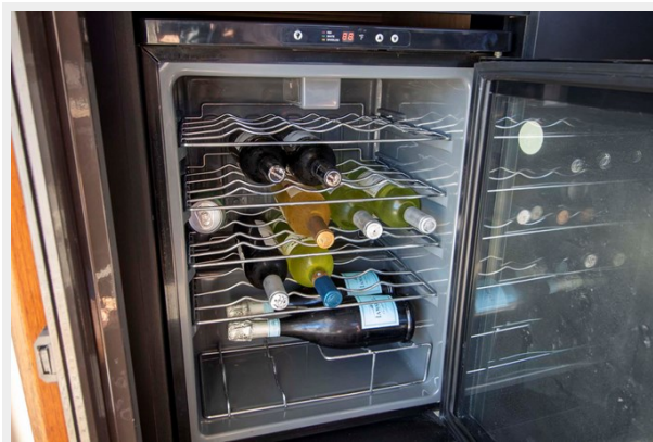
Salon Wine Cooler