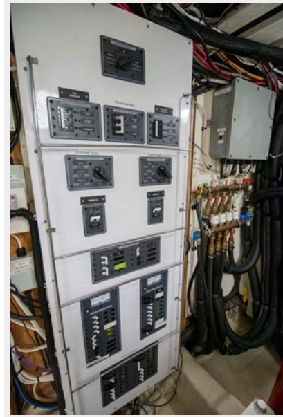
Primary AC Panel