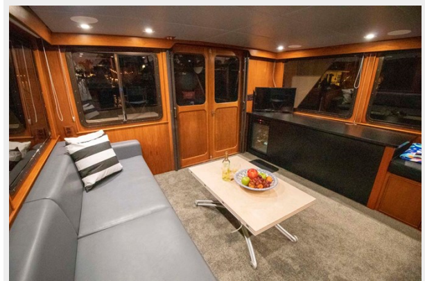
Salon Port Aft