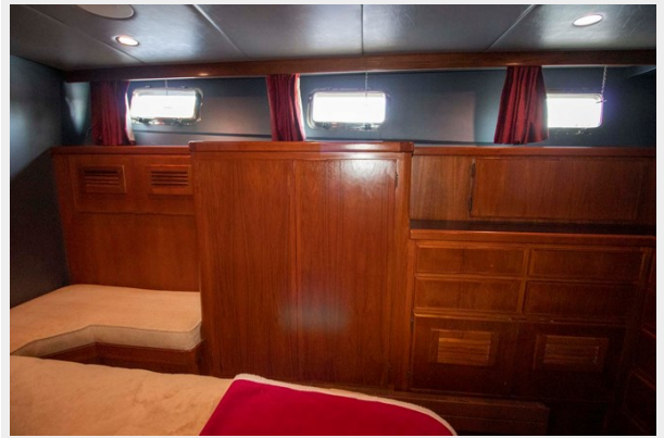
Master Starboard Closet Closed