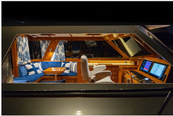
Helm and Salon