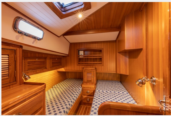
Guest Twin Cabin