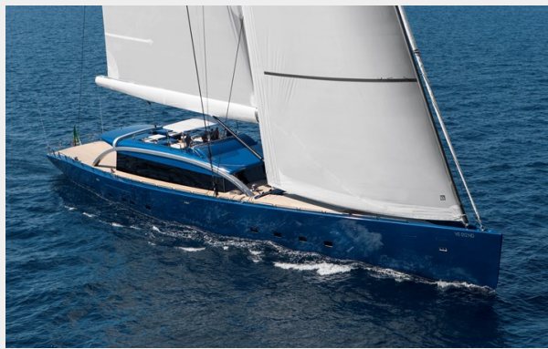
Exterior - 1