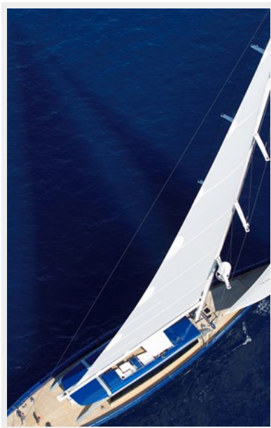
Exterior - 9