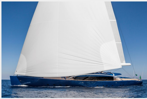
Exterior - 7