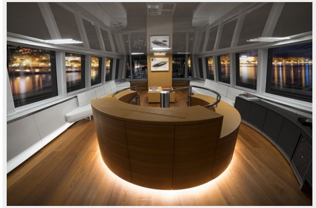
Main Deck - Staircase / Lounge