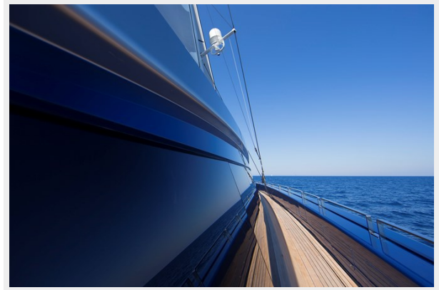
Exterior - 8