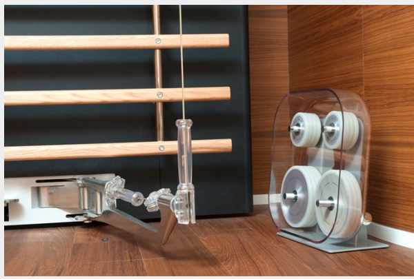
Gym - 1