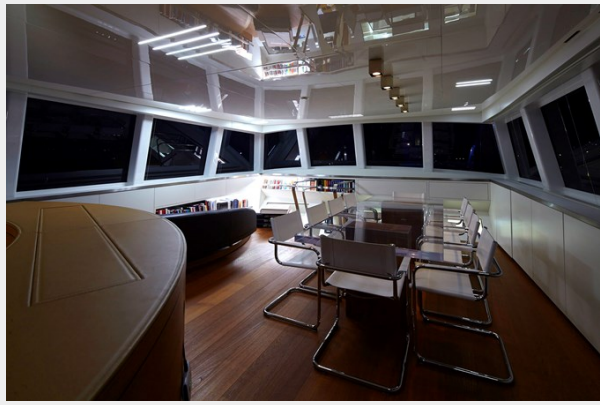
Main Deck - Dining