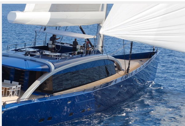
Exterior - 5