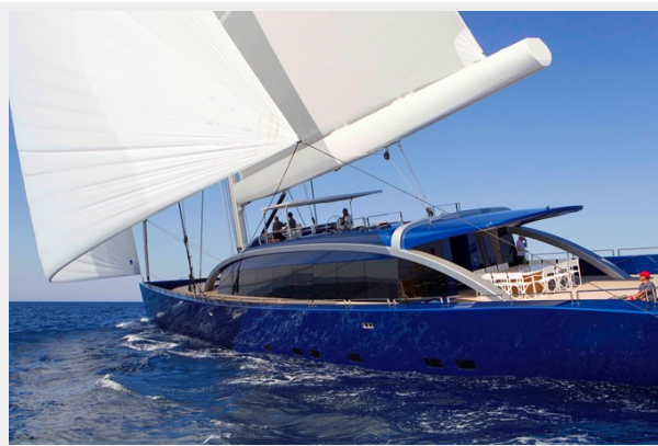
Exterior - 3