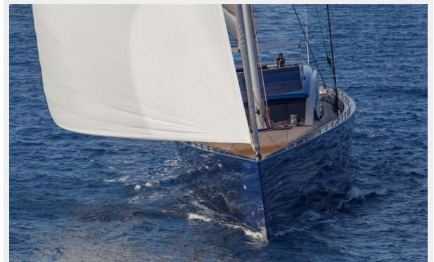
Exterior - 4