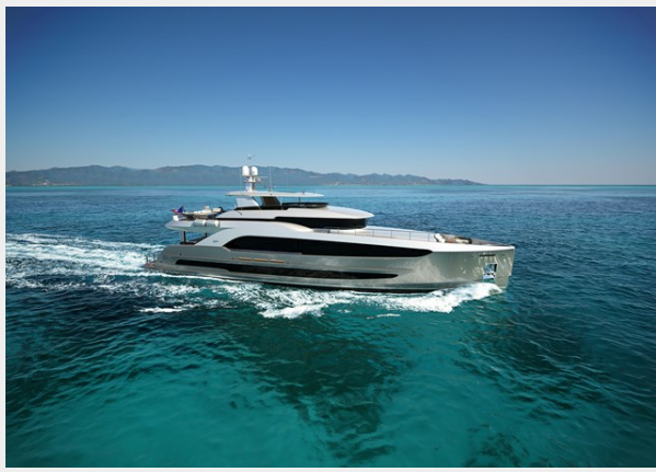
Burger 120 RPH (2)