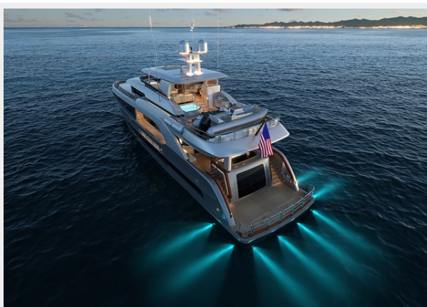
Burger 120 RPH (6)