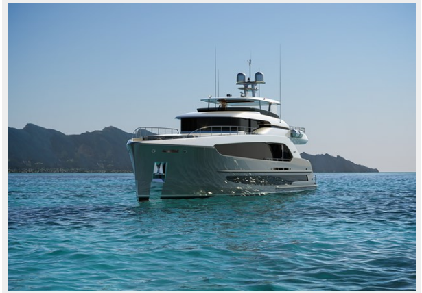
Burger 120 RPH (9)