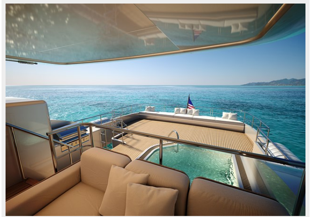
Burger 120 RPH (11)