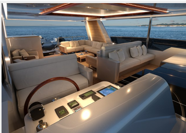
Burger 120 RPH (12)