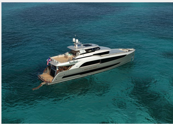
Burger 120 RPH (4)