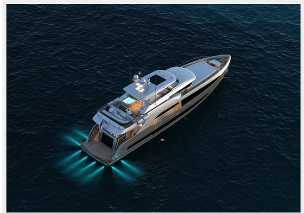
Burger 120 RPH (5)