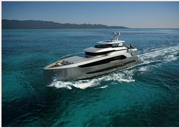
Burger 120 RPH (8)