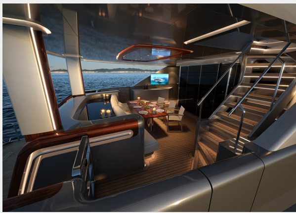
Burger 120 RPH (10)