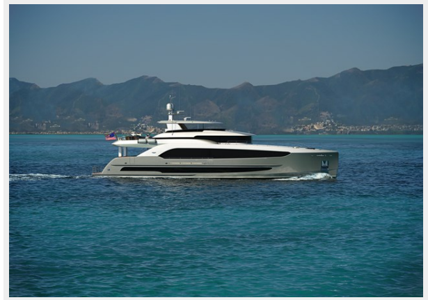
Burger 120 RPH (3)