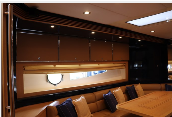
Riva 59 Salon Port Table1