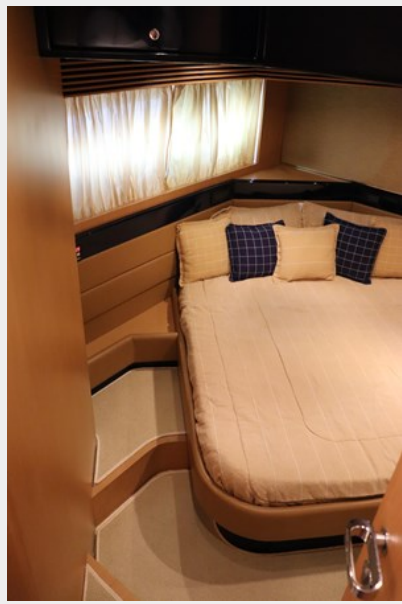
Riva 59 AFT Master1