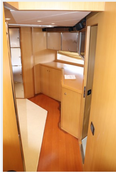
Riva 59 STBD Galley0