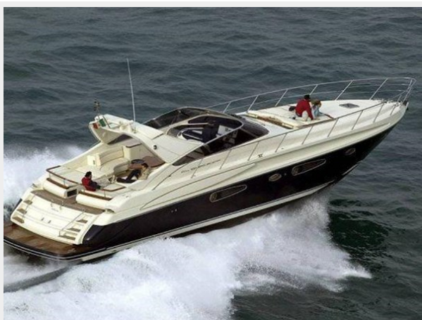
Riva 59 Sister Blue Hull Running