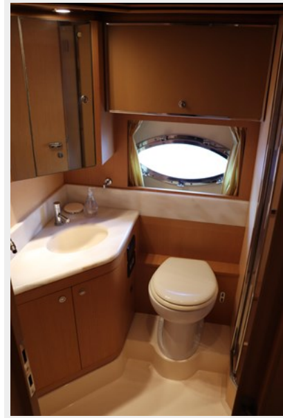
Riva 59 AFT Master Head1