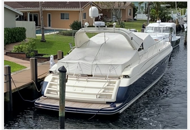
Riva 59 Covered2