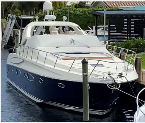
Riva 59 Covered0