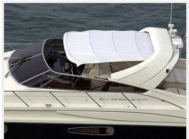
Riva 59 Sister Bimini Extended ARCH