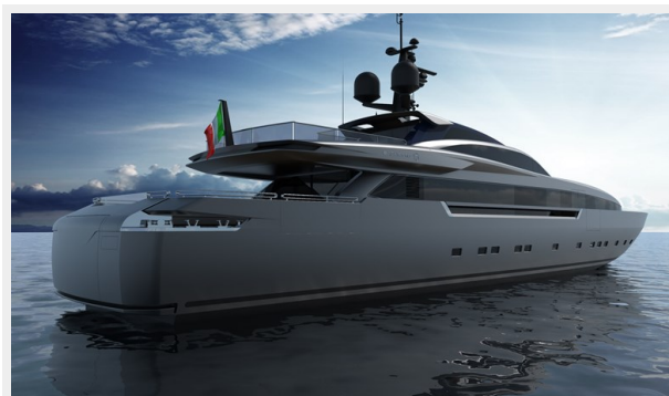
BAGLIETTO 43 FAST HARDTOP