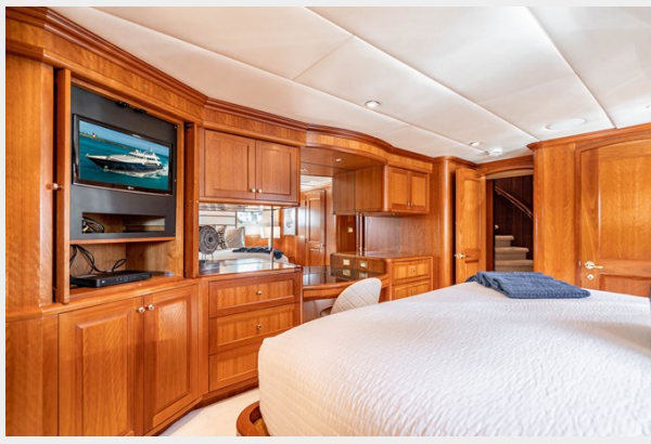
Queen Guest Stateroom