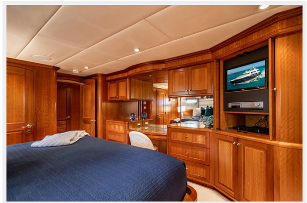
King Guest Stateroom