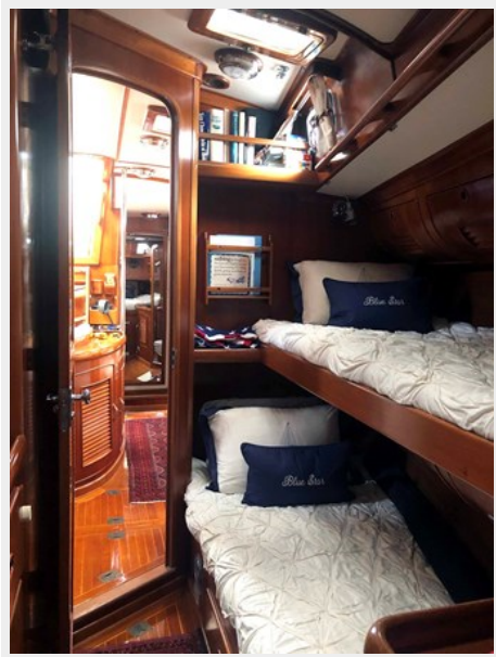
Port Fwd. Stateroom, Looking Aft