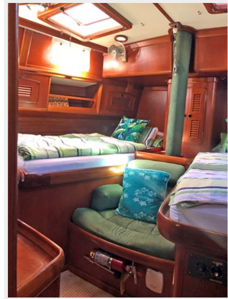
Owner's Aft Cabin