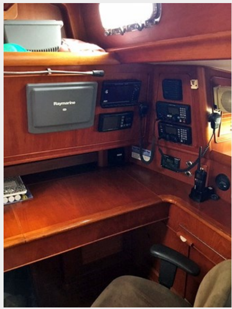
Nav Area Detail