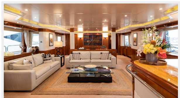
Main Salon 11_14_20_0009 (2)