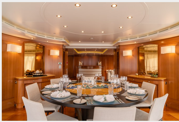
Main Dining Bridge Deck 11_14_20_0307 (1)