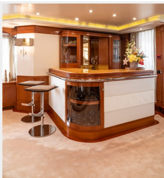
Main Salon Bar 11_14_20_0016 (1)