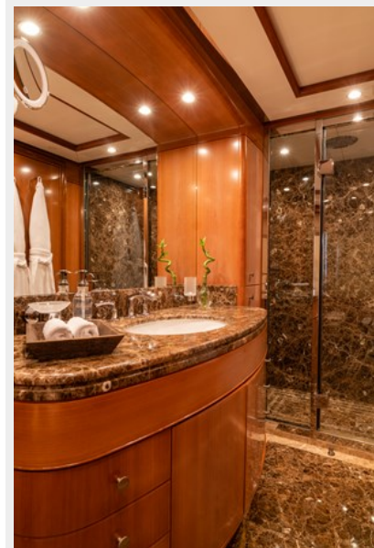
VIP Bath 11_14_20_0255 (1)