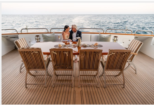
Aft Main Deck Dining 11_15_20_1048 (1)