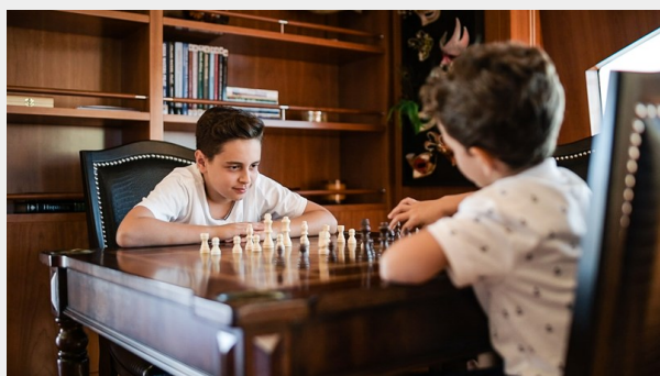
Sky Lounge Game Table 11_15_20_V_0064-2