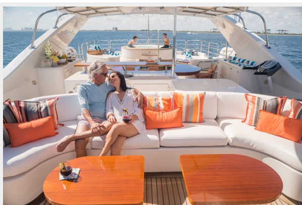
Sundeck Fwd Lounge 11_15_20_0490 (1)