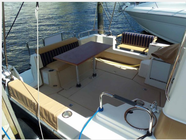
Cockpit Aft Deck