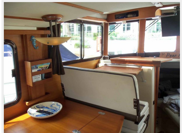
Dinette Converted to Companion Seat