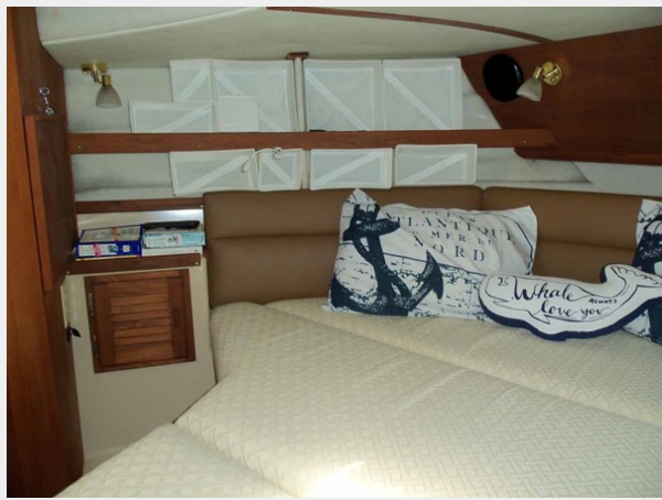
Forward Cabin Portside