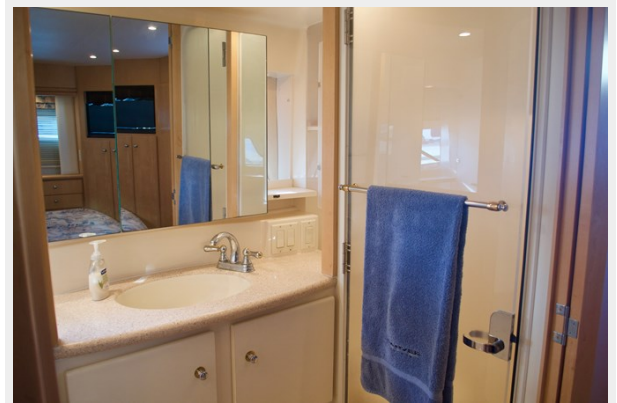
After Master Stateroom Head