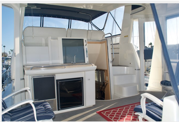
Sundeck Bar with sink, fridge, and freezer