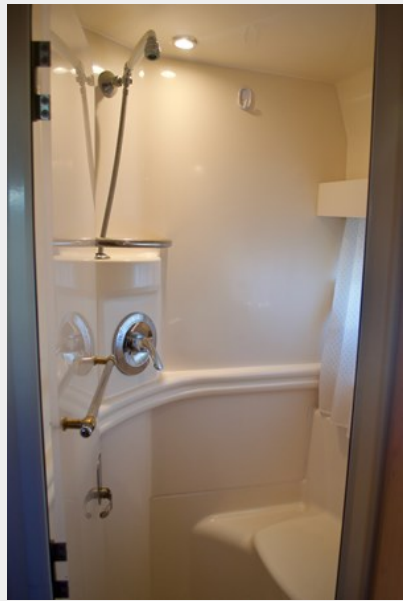
Aft Master Stateroom Head