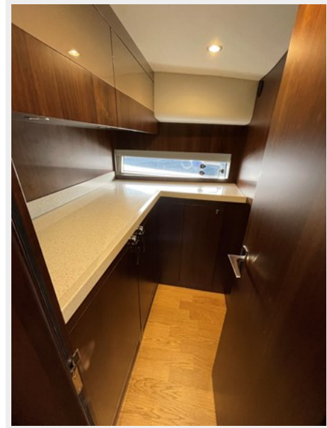
Galley - Fridge