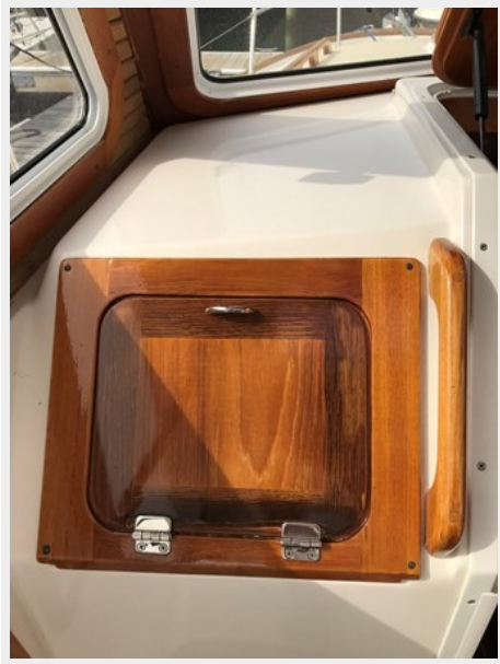
Bulldog Aft Seating

736DFA03-A9DF-4DD2-B4A9- 6D0D426DEC72_1_105_c