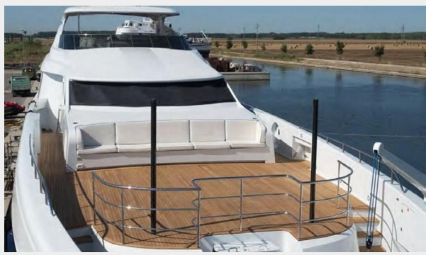
CG1055JB - HEESEN 48M - FOTOS (8)