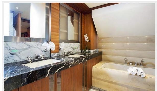
CG1055JB - HEESEN 48M - FOTOS (16)