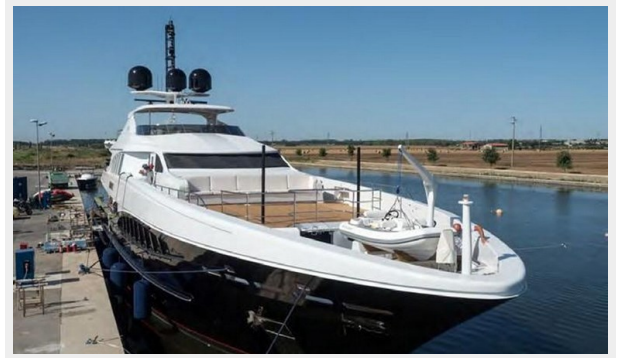
CG1055JB - HEESEN 48M - FOTOS (7)