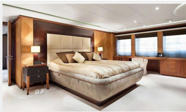
CG1055JB - HEESEN 48M - FOTOS (17)