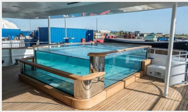
CG1055JB - HEESEN 48M - FOTOS (6)