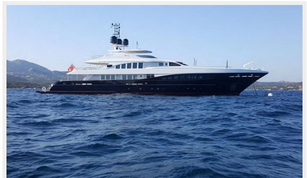
CG1055JB - HEESEN 48M - FOTOS (4)