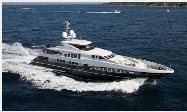
CG1055JB - HEESEN 48M - FOTOS (1)