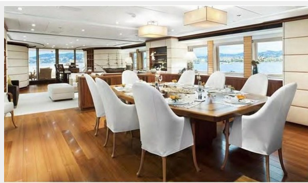
CG1055JB - HEESEN 48M - FOTOS (15)