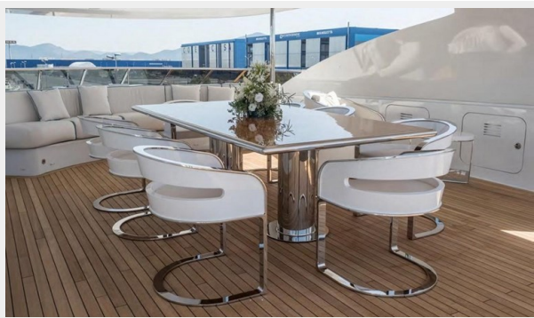
CG1055JB - HEESEN 48M - FOTOS (12)