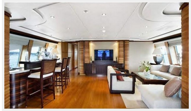
CG1055JB - HEESEN 48M - FOTOS (14)