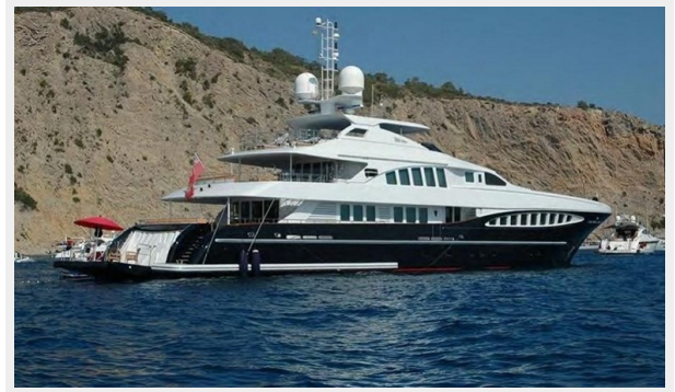
CG1055JB - HEESEN 48M - FOTOS (2)