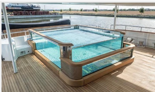
CG1055JB - HEESEN 48M - FOTOS (5)