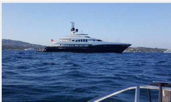
CG1055JB - HEESEN 48M - FOTOS (3)