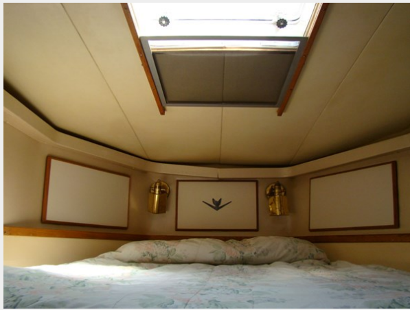
23. Master Ceiling