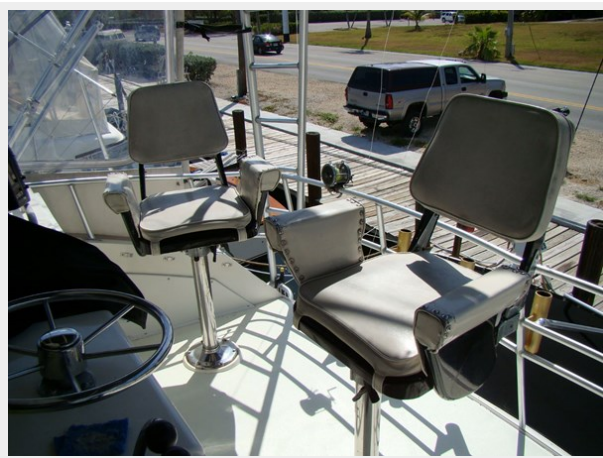
45. Fly Bridge Seating