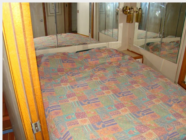
25. Guest Sateroom