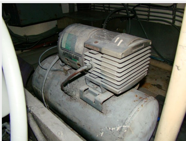
39. Air Comp