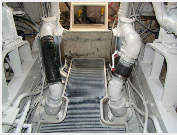
36. Engine Room