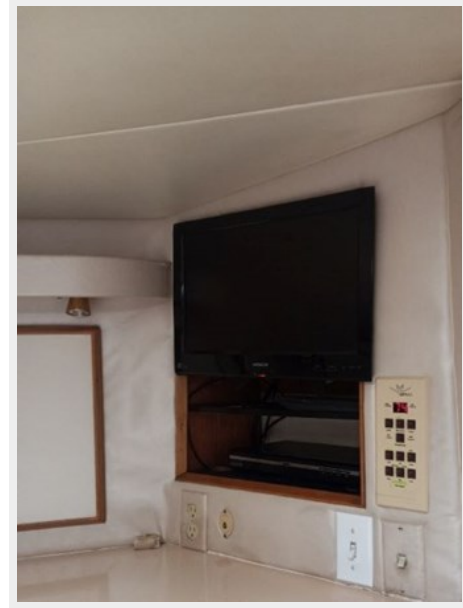
24. Master Entertainment Center