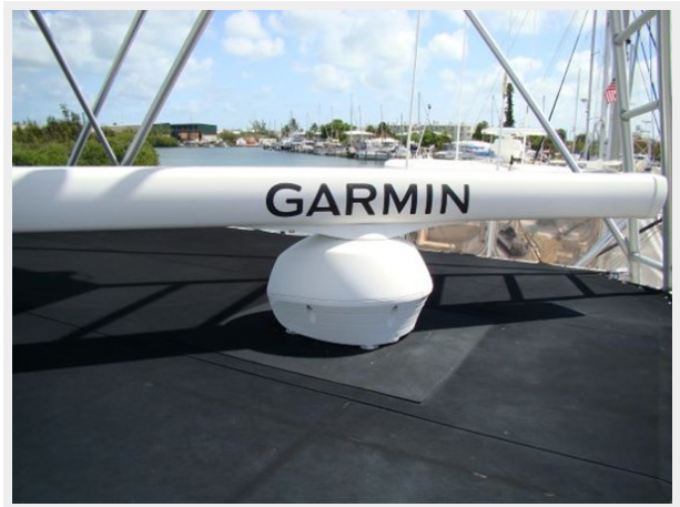
44. Open Array