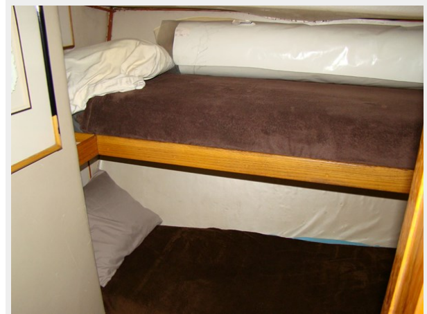
26. Crew Cabin