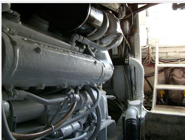
34. Starboard Main