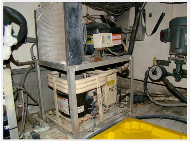
38. Salon AC