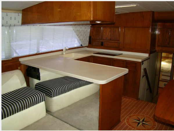
17. Galley Area