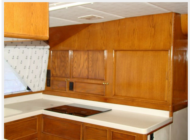
20. Galley Cabinets