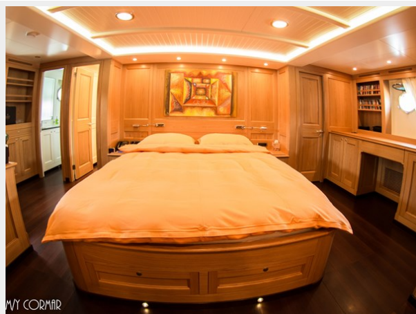
Warm Master cabin full equipped