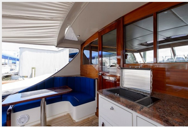
Cockpit cabin bulkhead