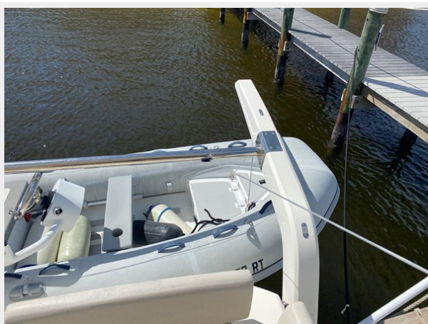
44 Aquila 2017 6