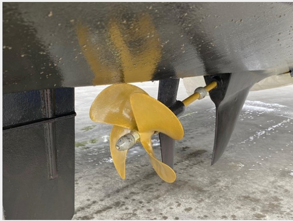
44 Aquila 2017 8