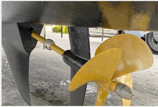
44 Aquila 2017 20