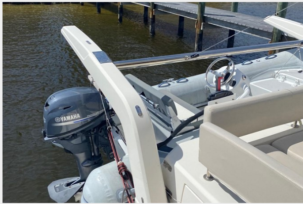
44 Aquila 2017 14