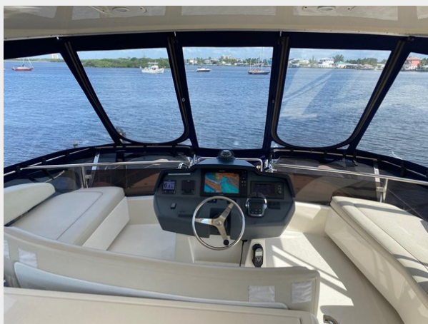
44 Aquila 2017 12