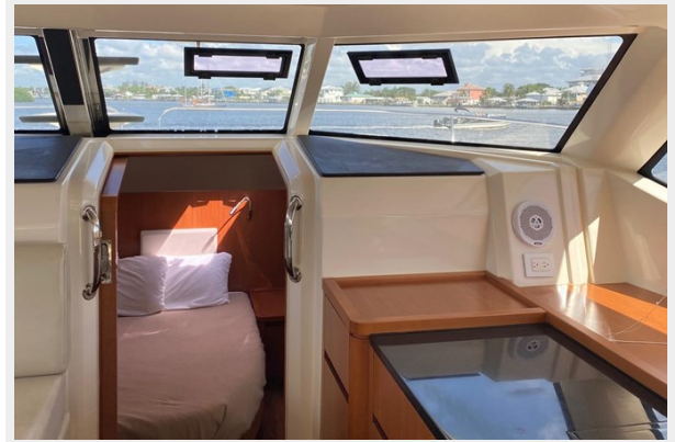
44 Aquila 2017 15