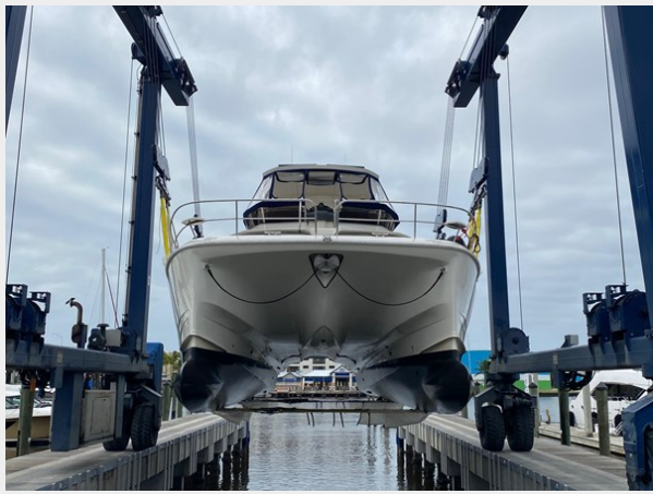
44 Aquila 2017 10