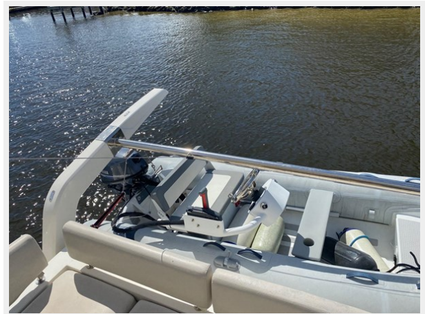
44 Aquila 2017 5