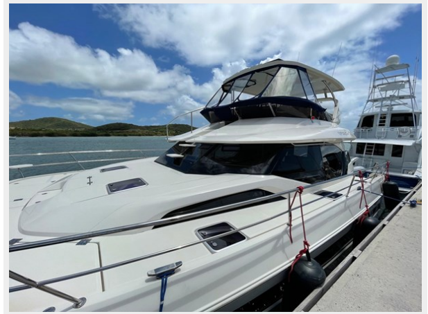
44 Aquila 2017 11