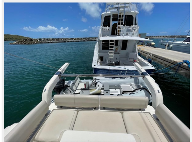
44 Aquila 2017 3