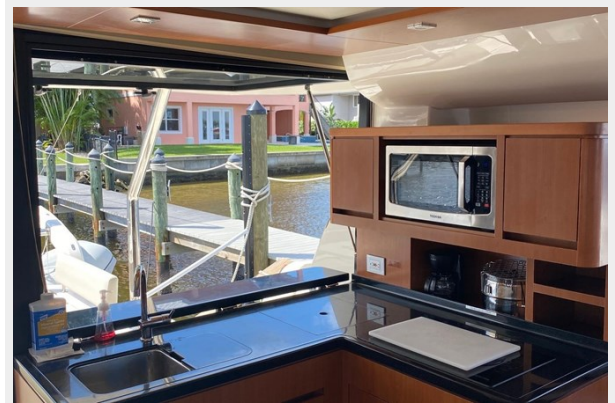
44 Aquila 2017 17