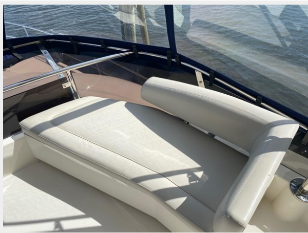
44 Aquila 2017 4