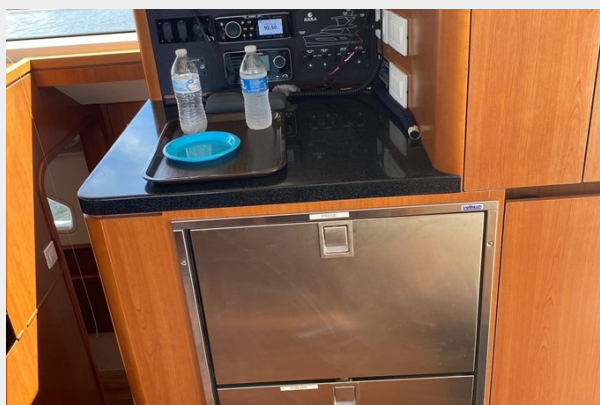
44 Aquila 2017 22