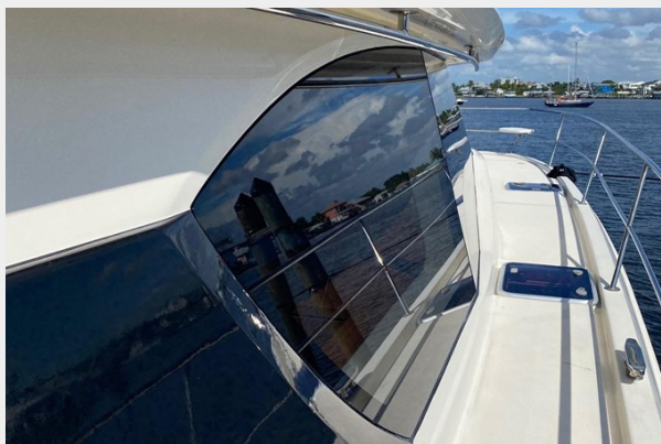
44 Aquila 2017 16