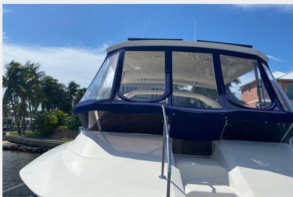
44 Aquila 2017 18