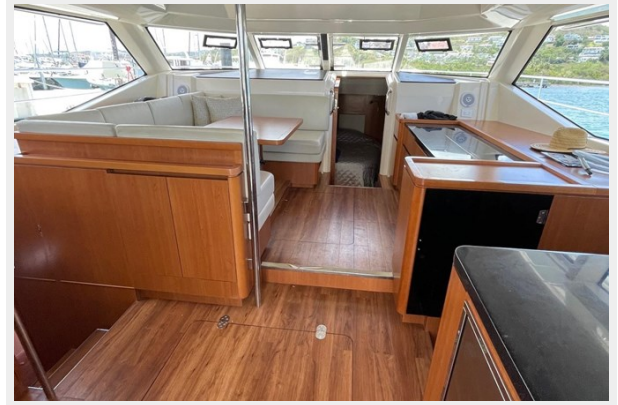
44 Aquila 2017 21