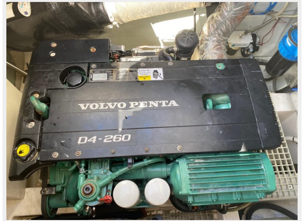
44 Aquila 2017 9