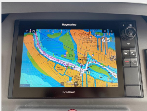
44 Aquila 2017 2