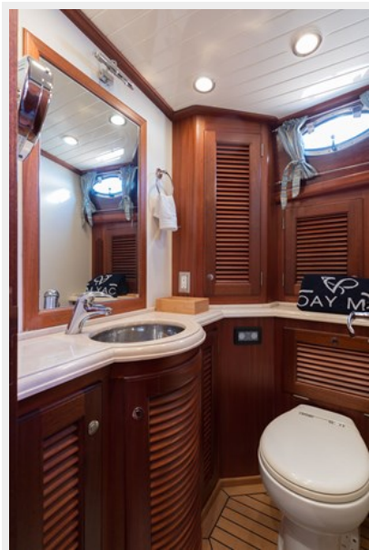
Owner Stateroom Head