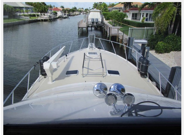
Bow from FB