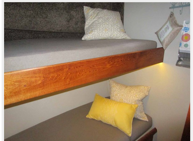
Guest Cabin Looking Aft