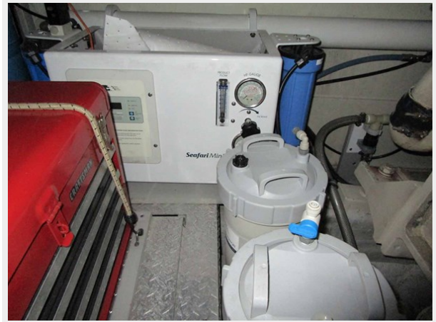
New Water Maker