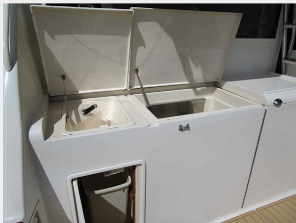
Sink and Freezer