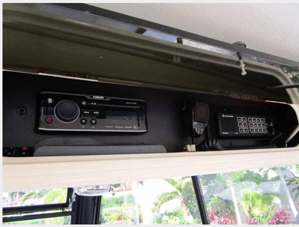
Stereo and Hailer