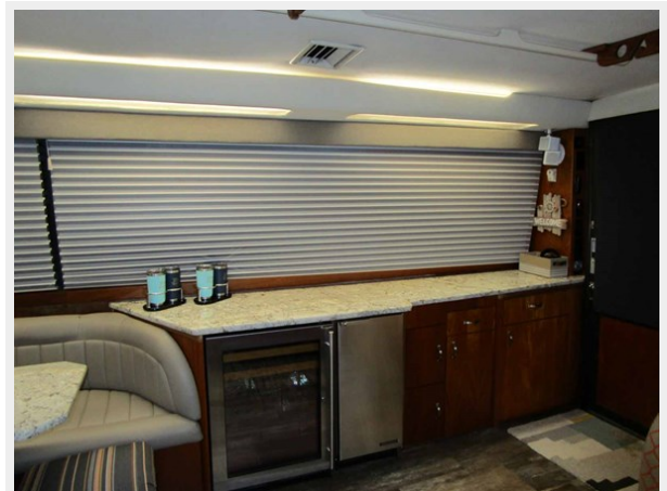
Salon Stbd Side