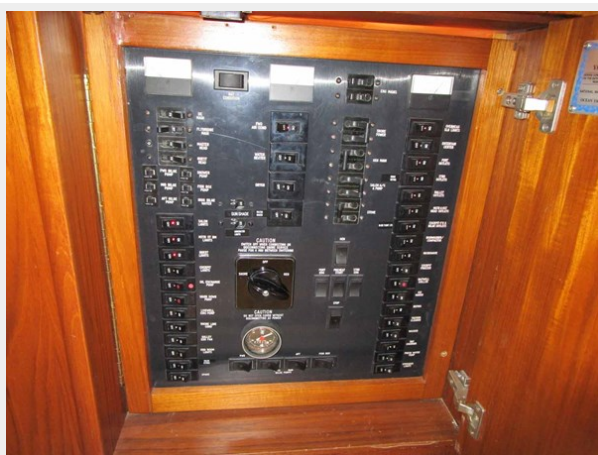
Salon Electric Panel