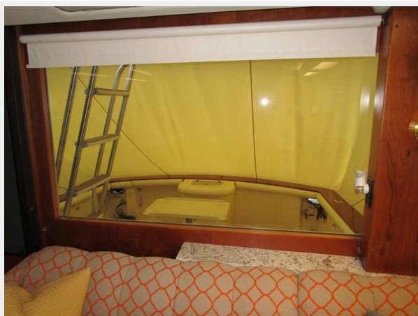
Salon Looking into Cockpit