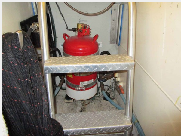
Engine Room Access