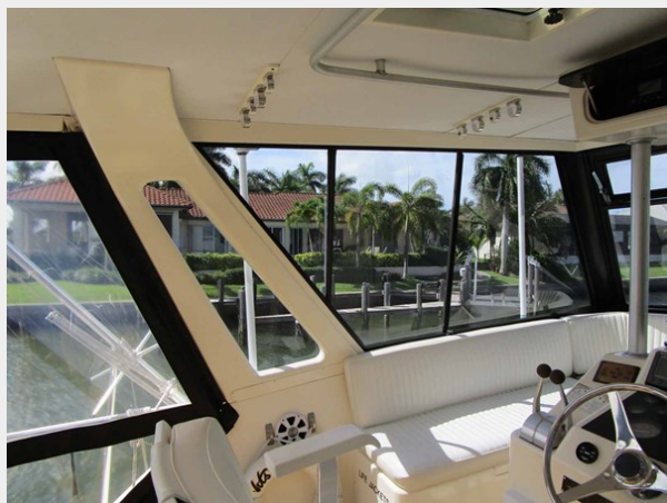
FB Side Windows