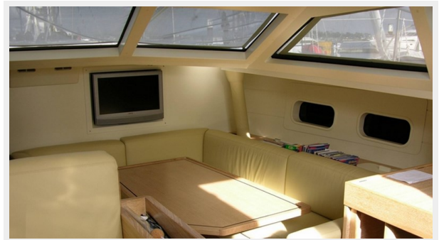
SWEET_LIFE_II_ Alliage_56_DS_Centreboard_Sailing_Yacht _006