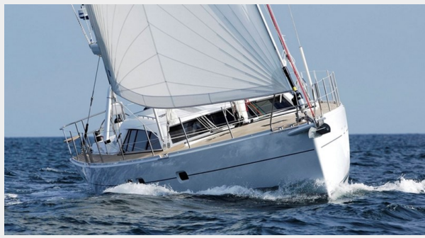
SWEET_LIFE_II_ Alliage_56_DS_Centreboard_Sailing_Yacht _002