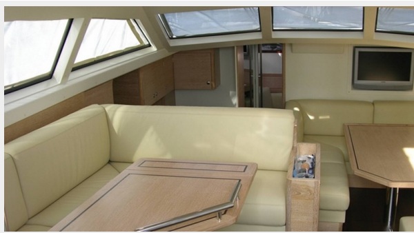
SWEET_LIFE_II_ Alliage_56_DS_Centreboard_Sailing_Yacht _004