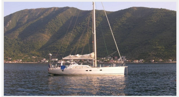
SWEET_LIFE_II_ Alliage_56_DS_Centreboard_Sailing_Yacht _004