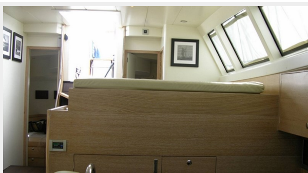
SWEET_LIFE_II_ Alliage_56_DS_Centreboard_Sailing_Yacht _006