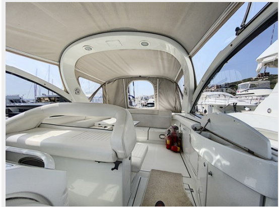
Pershing392000- 1624432464_1624432525_32609_6a83edc Pershing392000- 1624432464_1624432737_32772_95737f2