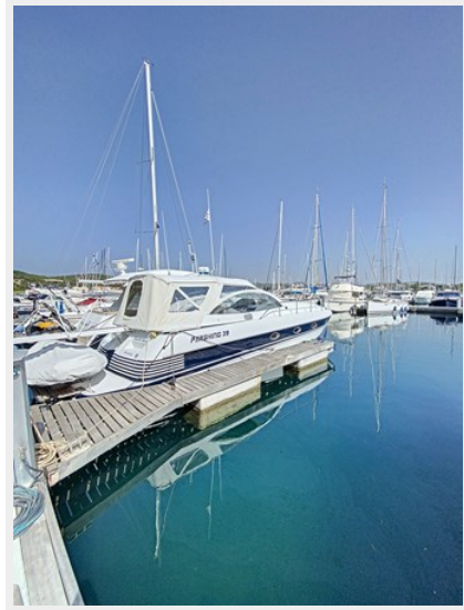
Pershing392000- 1624432464_1624432773_32784_b8a0cc5 Pershing392000- 1624432464_1624432842_32856_5e9311d