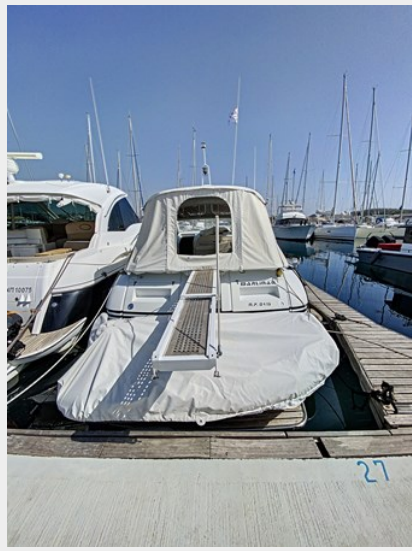
Pershing392000- 1624432464_1624432501_32513_5161f20 Pershing392000- 1624432464_1624432513_32524_4a89c93