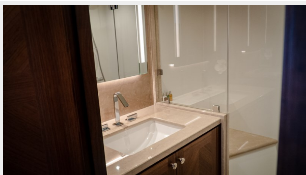
STB Guest Stateroom Head 1