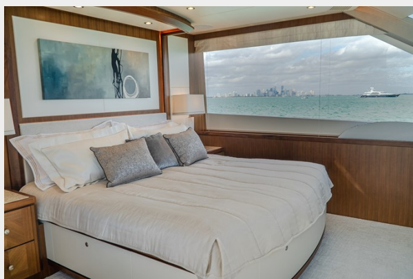
Master Stateroom 4