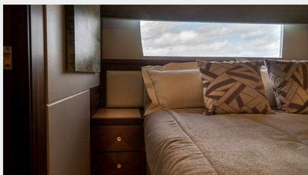
STB Guest Stateroom 1