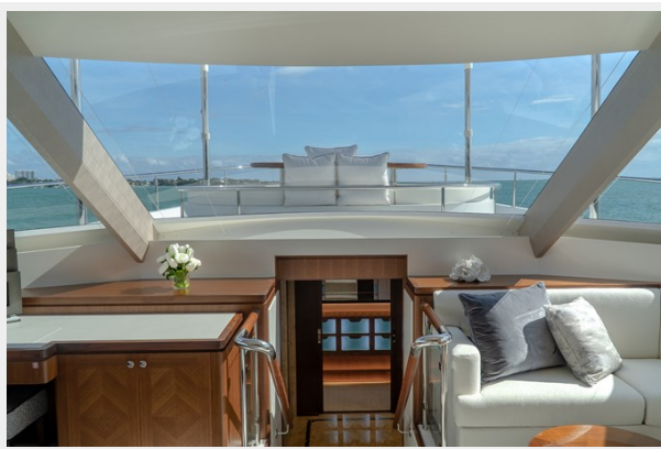
Companion Way 1