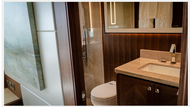
VIP Stateroom Head 1