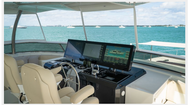
Flybridge Helm 1