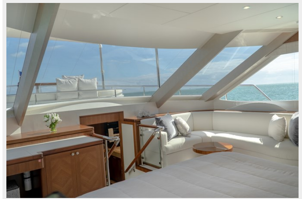
Master Stateroom 3