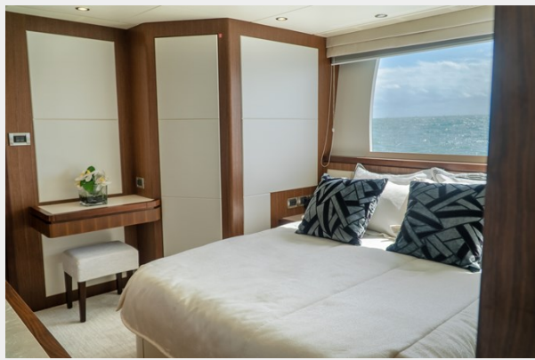
VIP Stateroom 2