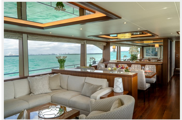
Salon/ Galley 1