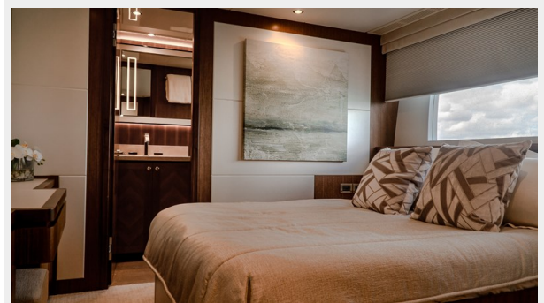
STB Guest Stateroom 2