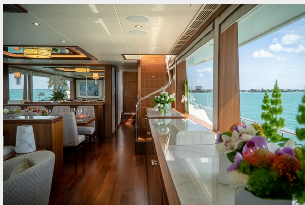
Salon/ Galley 2