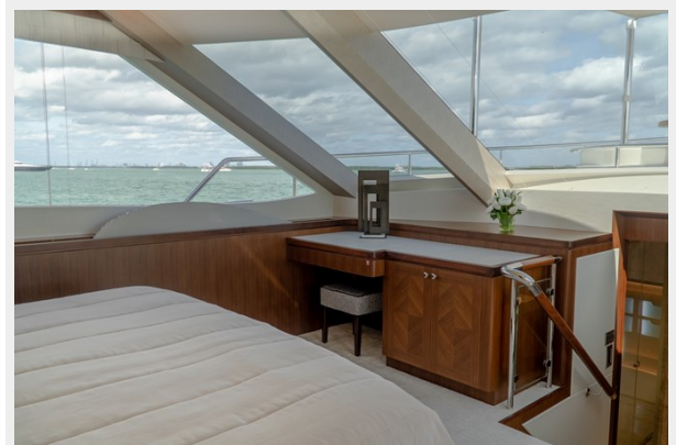
Master Stateroom 5