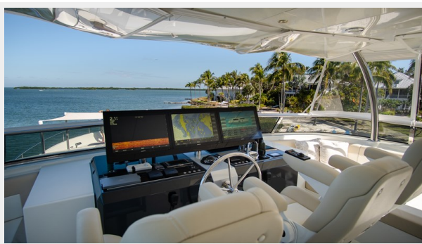
Flybridge Helm 2