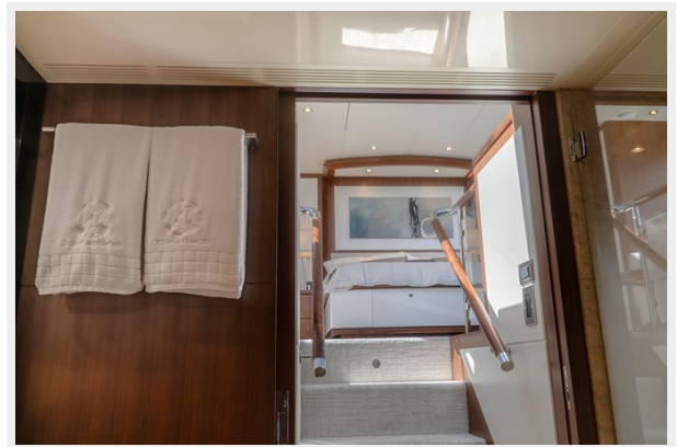
Companion Way 2