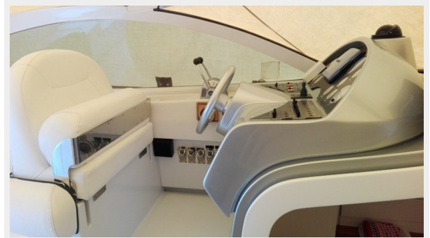
WhatsApp Image 2020-03-07 at 09.42.39 (1)