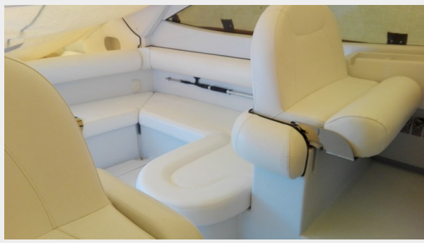
WhatsApp Image 2020-03-07 at 09.42.40