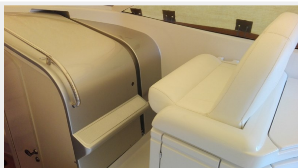
WhatsApp Image 2020-03-07 at 09.42.42