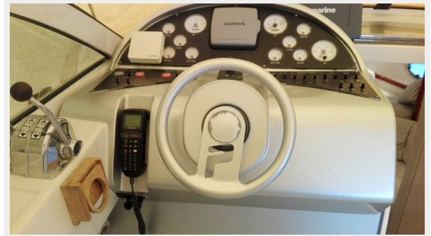
WhatsApp Image 2020-03-07 at 09.42.41