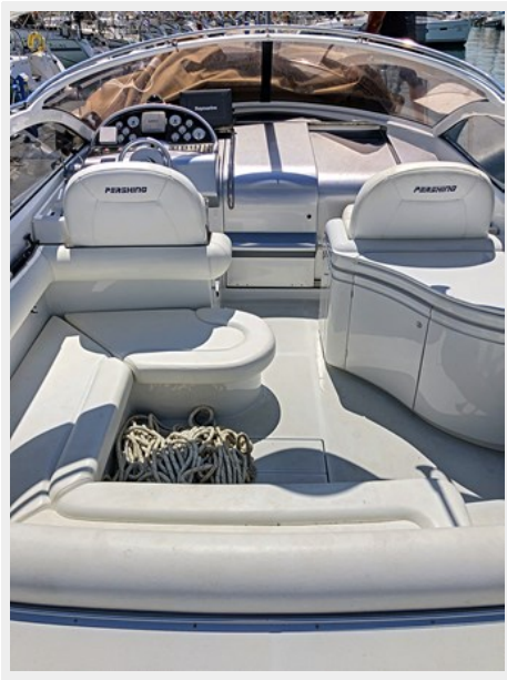
WhatsApp Image 2020-03-07 at 09.42.39