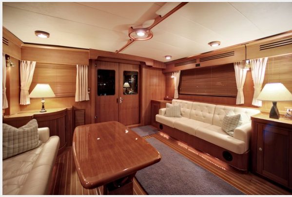
Salon Port Side Aft