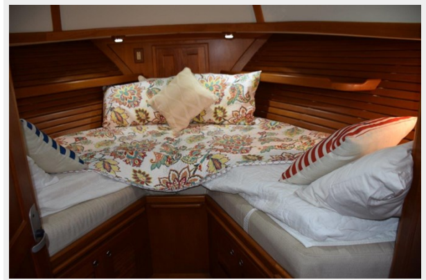
Forward Berth with filler cushion