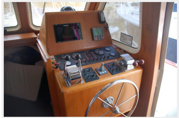
Lower Helm Station