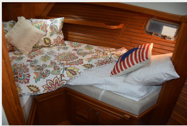
Traditional Wood Sheathing on Forward stateroom hull walls