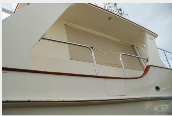
Side Deck Entry Gates