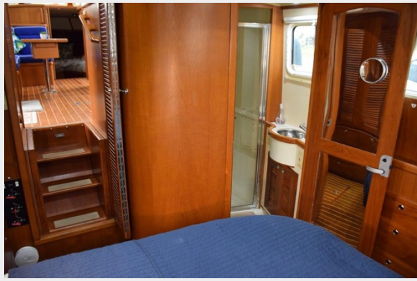
Master Stateroom Forward View