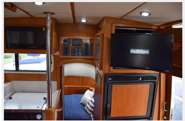
TV on Swing out Mount in Cabinet