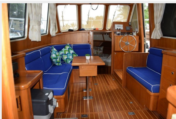
Salon Forward View