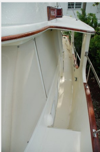
Covered Side Deck with High Bulwarks