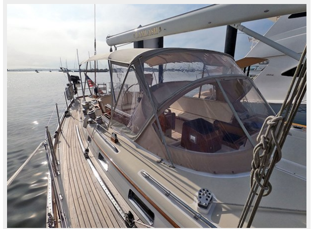
Looking Aft from Mast