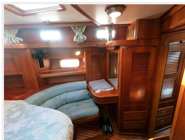
Owners Cabin Port