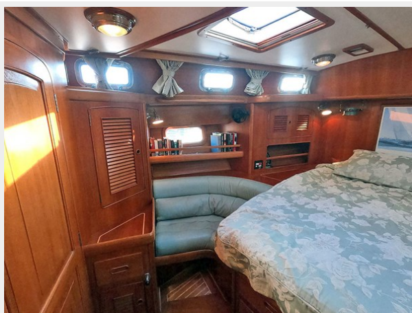
Owners Cabin Starboard