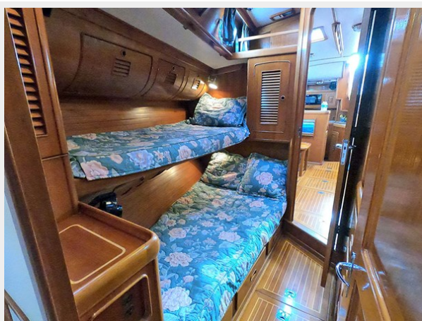
Starboard Guest Cabin