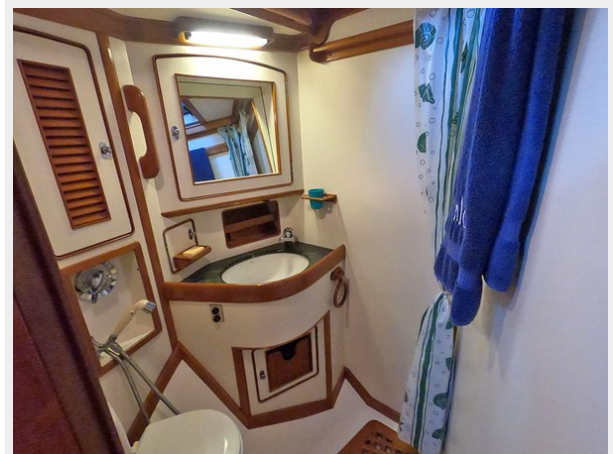
Port Guest Head