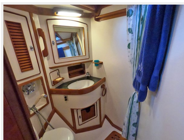
Port Guest Head