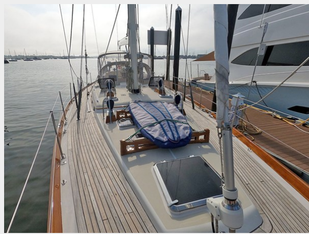
Looking Aft from Bow