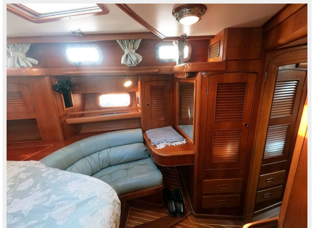
Owners Cabin Port