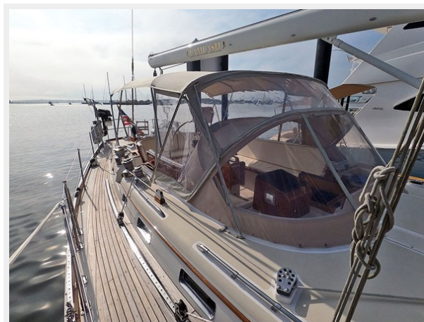
Looking Aft from Mast