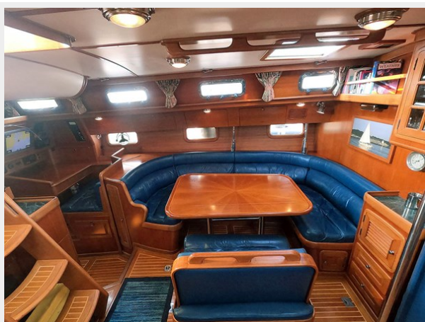
Main Salon, Port