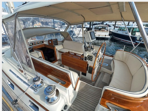
Cockpit Side View