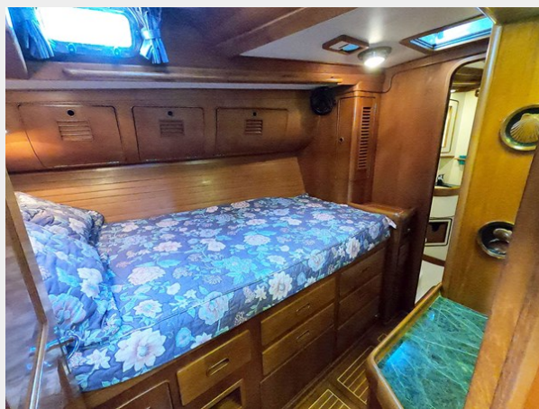
Port Guest Cabin