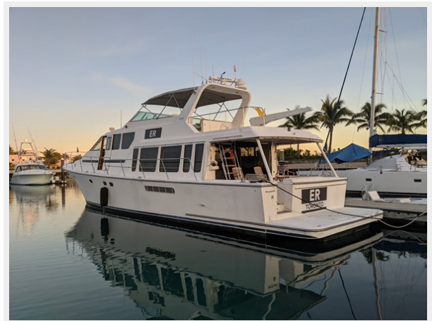
3_2000 65ft Pacific Mariner 65 ER