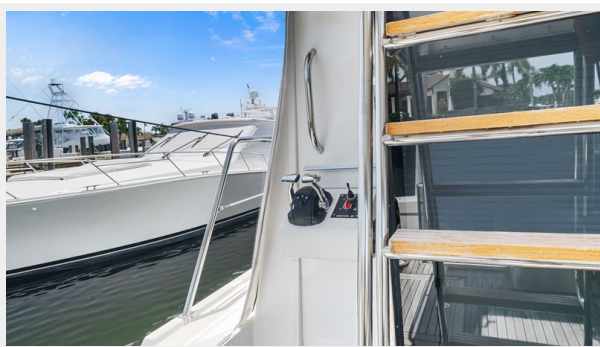
12_2000 65ft Pacific Mariner 65 ER