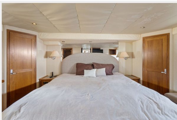
32_2000 65ft Pacific Mariner 65 ER