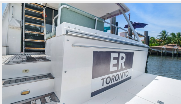
14_2000 65ft Pacific Mariner 65 ER