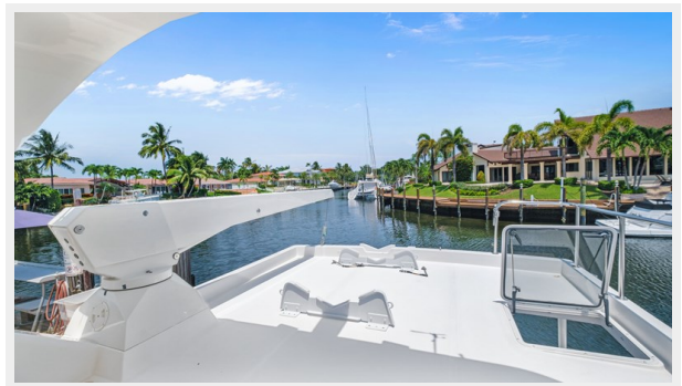
11_2000 65ft Pacific Mariner 65 ER