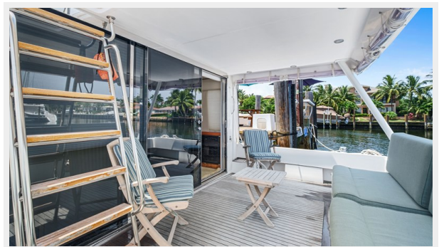
13_2000 65ft Pacific Mariner 65 ER