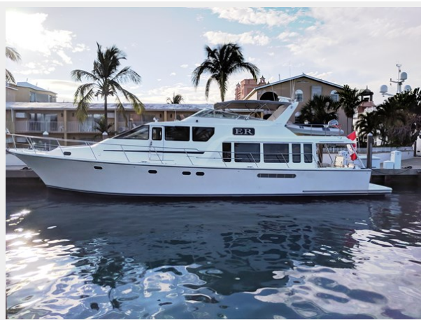
2_2000 65ft Pacific Mariner 65 ER