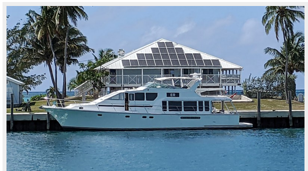
5_2000 65ft Pacific Mariner 65 ER