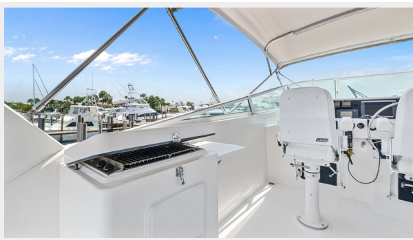
10_2000 65ft Pacific Mariner 65 ER