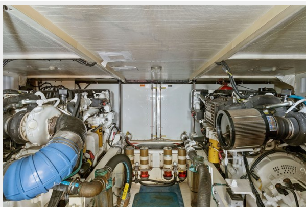
44_2000 65ft Pacific Mariner 65 ER