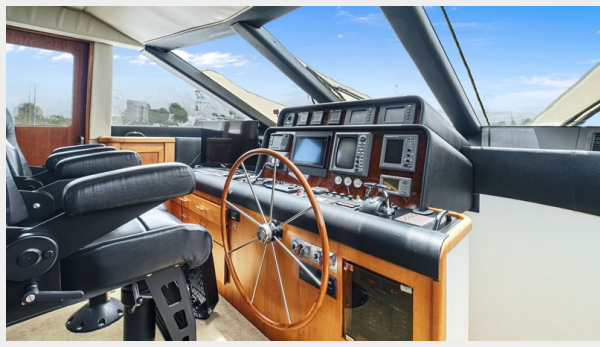
28_2000 65ft Pacific Mariner 65 ER