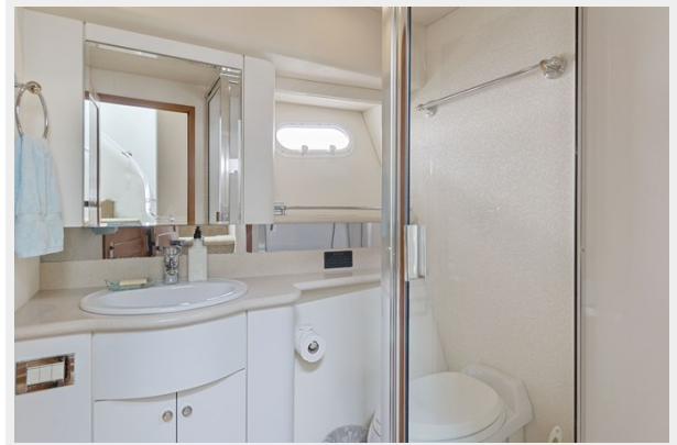
41_2000 65ft Pacific Mariner 65 ER