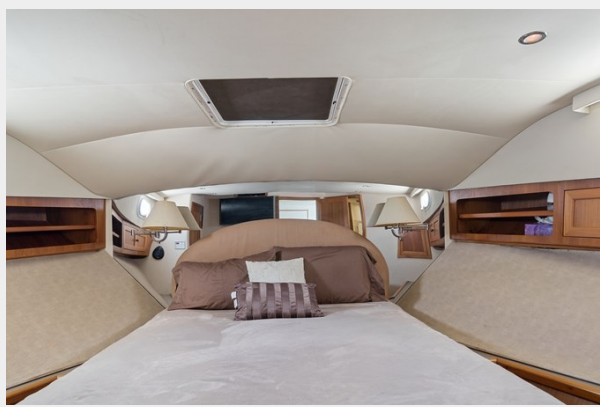
36_2000 65ft Pacific Mariner 65 ER