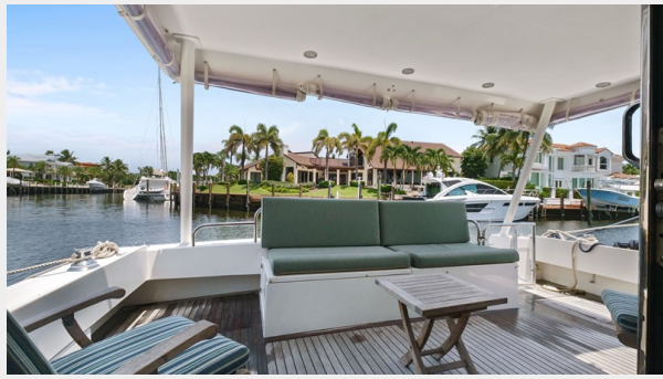
16_2000 65ft Pacific Mariner 65 ER