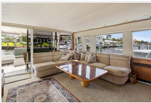
18_2000 65ft Pacific Mariner 65 ER