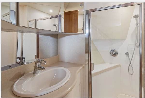
38_2000 65ft Pacific Mariner 65 ER