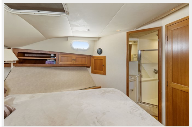
37_2000 65ft Pacific Mariner 65 ER