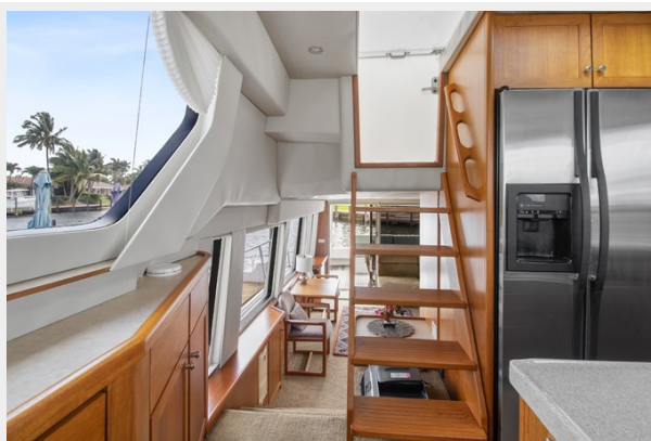
20_2000 65ft Pacific Mariner 65 ER