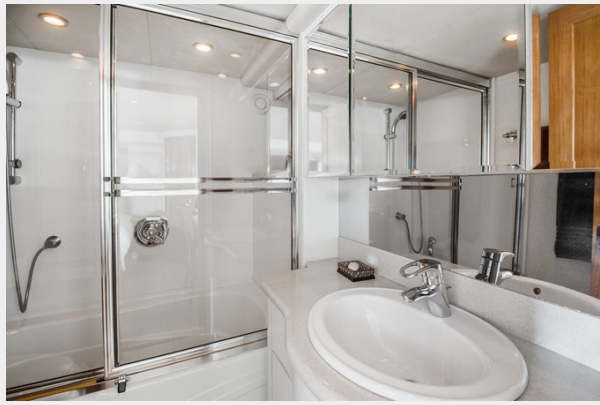
34_2000 65ft Pacific Mariner 65 ER