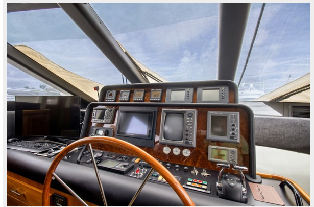
29_2000 65ft Pacific Mariner 65 ER