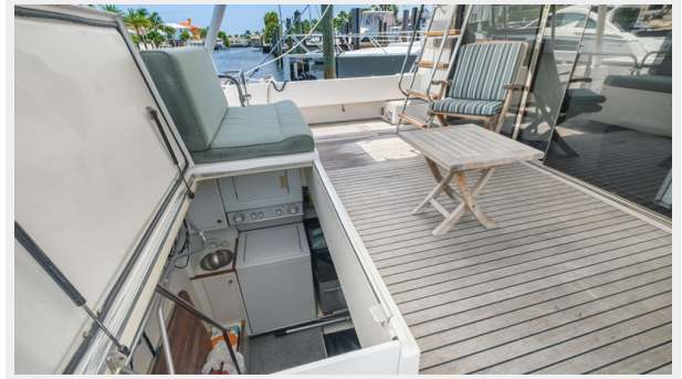
17_2000 65ft Pacific Mariner 65 ER