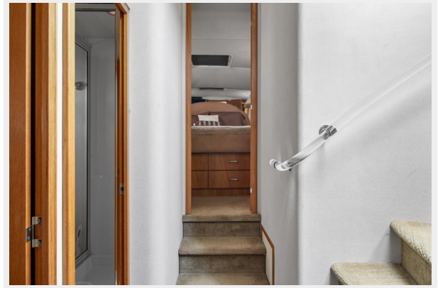
35_2000 65ft Pacific Mariner 65 ER