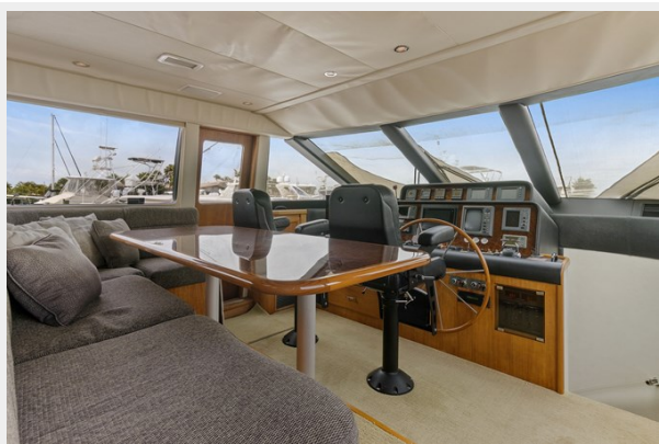
26_2000 65ft Pacific Mariner 65 ER