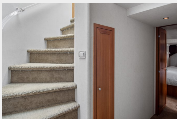
30_2000 65ft Pacific Mariner 65 ER