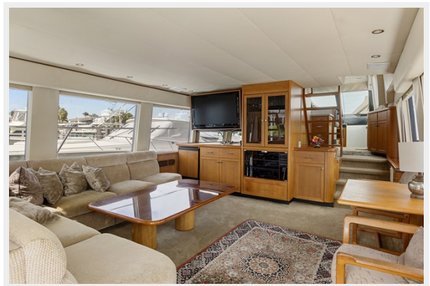
19_2000 65ft Pacific Mariner 65 ER