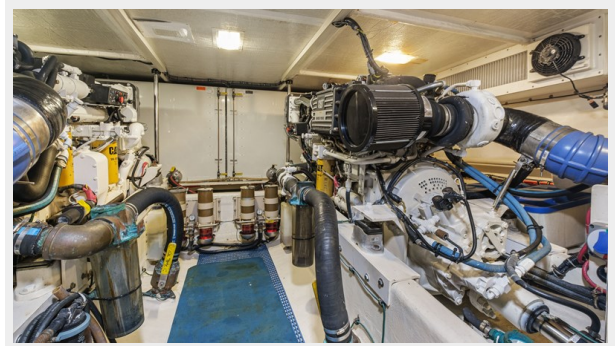
43_2000 65ft Pacific Mariner 65 ER