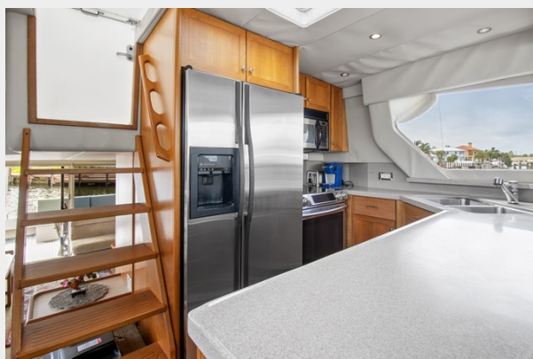
24_2000 65ft Pacific Mariner 65 ER