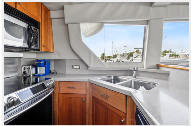
23_2000 65ft Pacific Mariner 65 ER