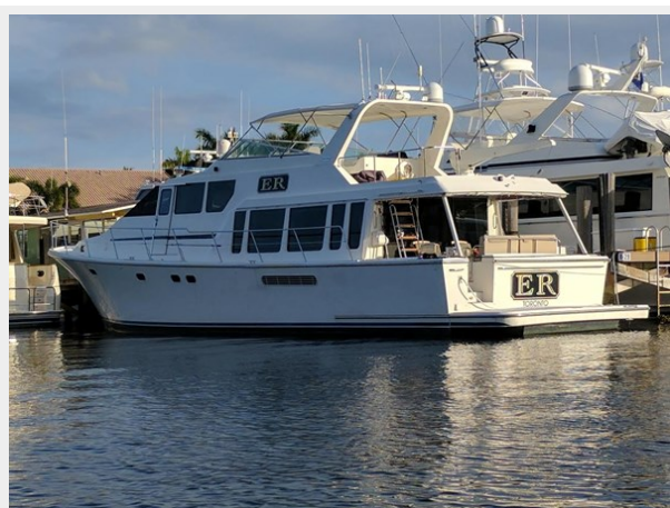
4_2000 65ft Pacific Mariner 65 ER