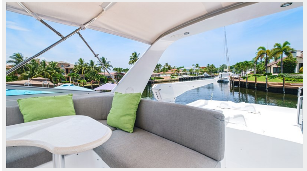
9_2000 65ft Pacific Mariner 65 ER