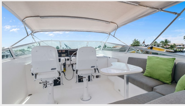
8_2000 65ft Pacific Mariner 65 ER