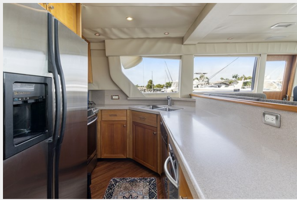
22_2000 65ft Pacific Mariner 65 ER