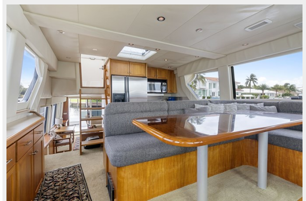
25_2000 65ft Pacific Mariner 65 ER