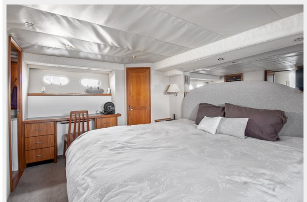
31_2000 65ft Pacific Mariner 65 ER