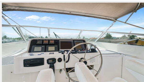
6_2000 65ft Pacific Mariner 65 ER