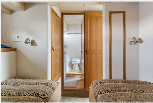
40_2000 65ft Pacific Mariner 65 ER