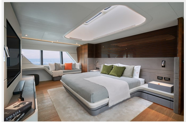
CLX96_INTERIOR 07_MASTER SUITE