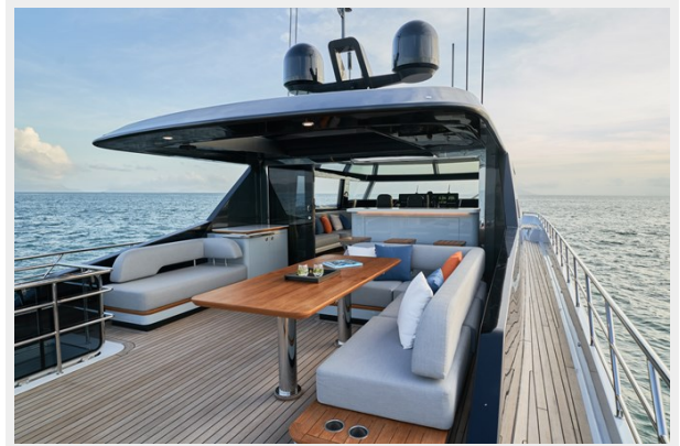
CLX96_EXTERIOR 16_SKY DECK 01