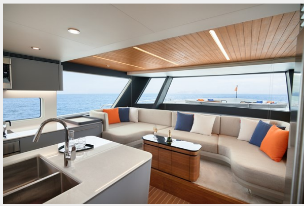
CLX96_INTERIOR 06_CHAMPAGNE LOUNGE