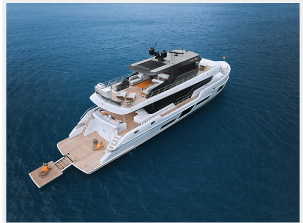
CLX96_EXTERIOR 07_PIAZZA DEL SOLE