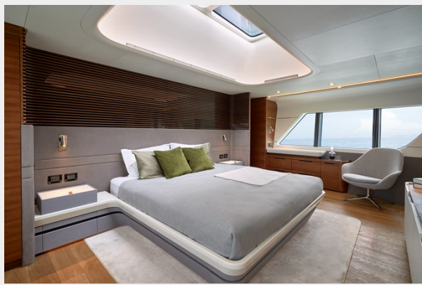
CLX96_INTERIOR 08_MASTER SUITE