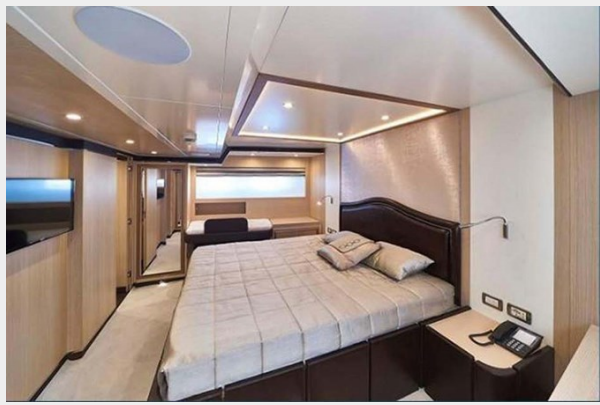
BLUE BERRY (14)