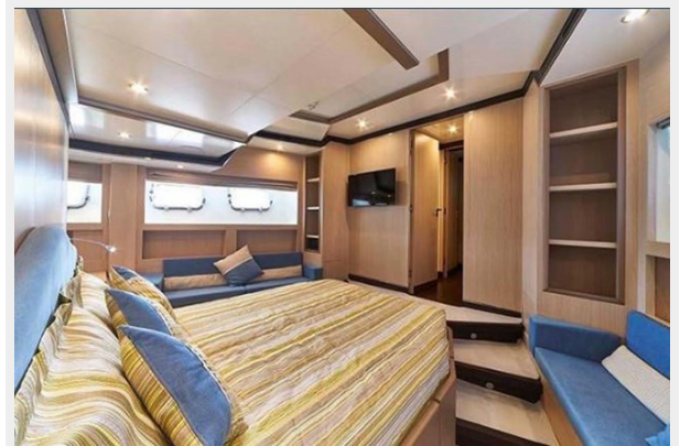
BLUE BERRY (17)