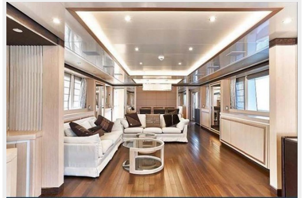
BLUE BERRY (9)