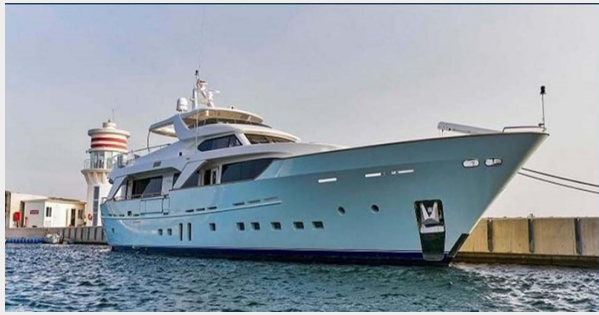
BLUE BERRY (2)