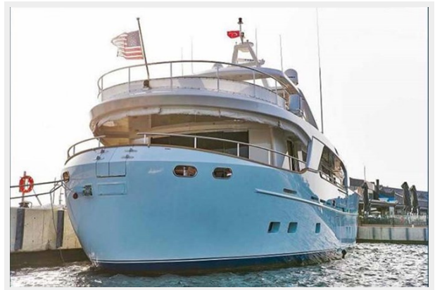
BLUE BERRY (3)