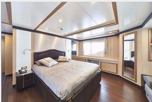
BLUE BERRY (12)