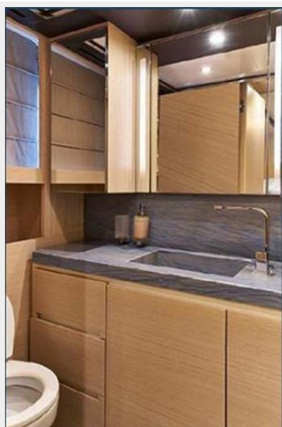
BLUE BERRY (18)