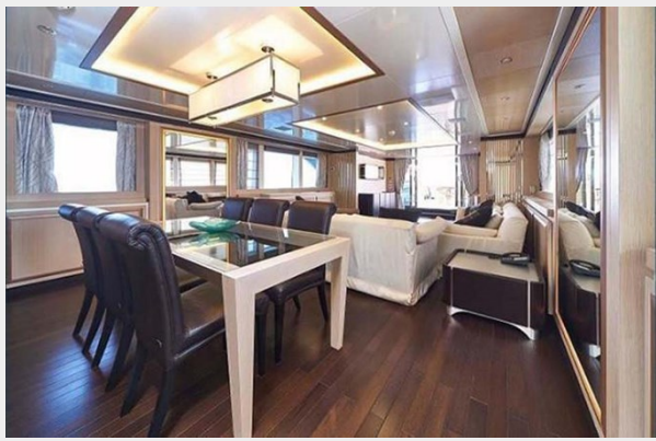
BLUE BERRY (10)