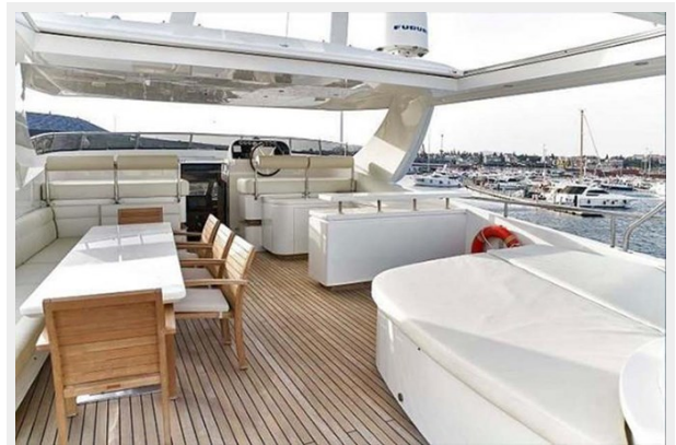
BLUE BERRY (5)