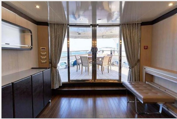
BLUE BERRY (8)