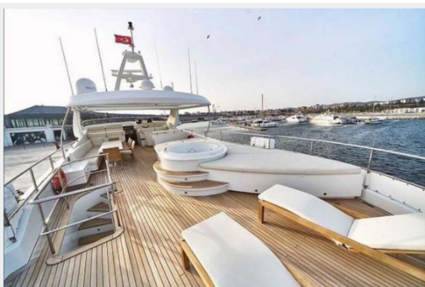
BLUE BERRY (6)