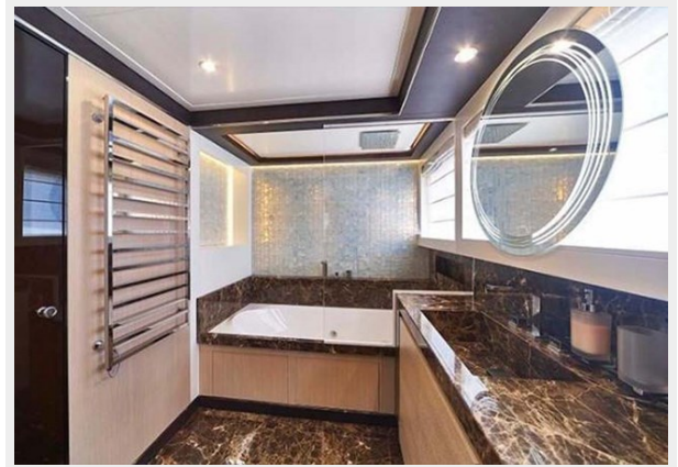
BLUE BERRY (15)