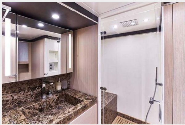
BLUE BERRY (16)