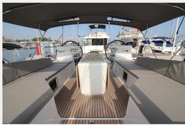
Jeanneau 54 - cockpit cushions looking aft S