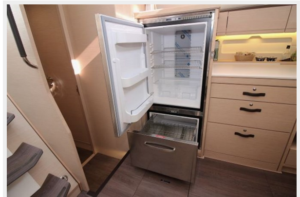
Jeanneau 54 - Fridge open ss