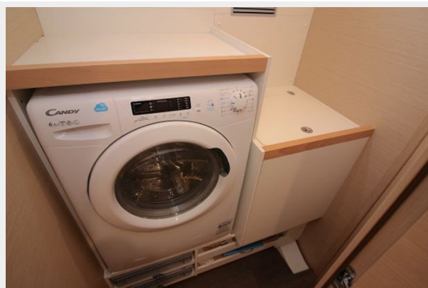
Jeanneau 54 - washer machine ss