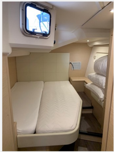
aft vip cabin