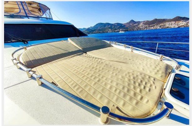
Sunbathing cushions on bow