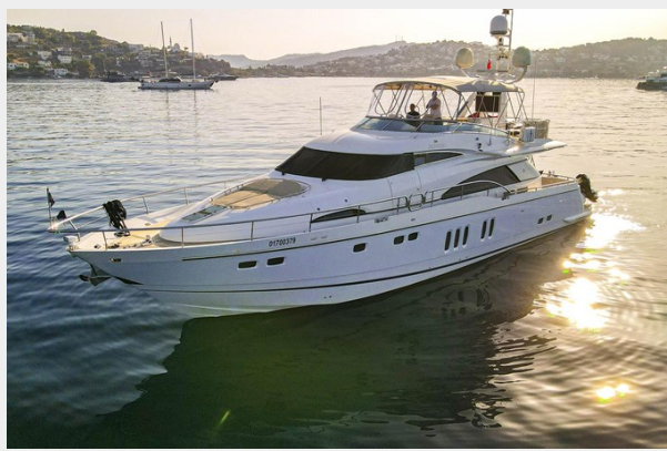
Exterior Fairline Squadron 74 M/Y "SEVEN" Exterior Fairline Squadron 74 M/Y "SEVEN"