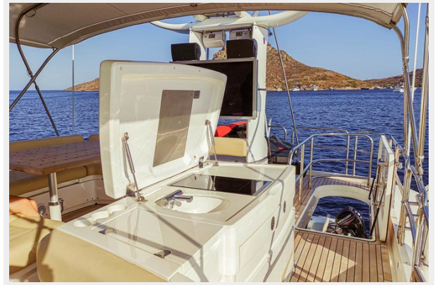
Wet bar on flybridge