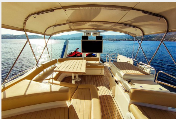
Dining area on flybridge