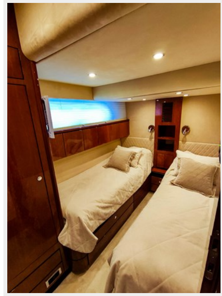
Guest cabin on starboard side