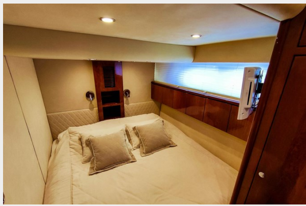
Guest cabin on port side