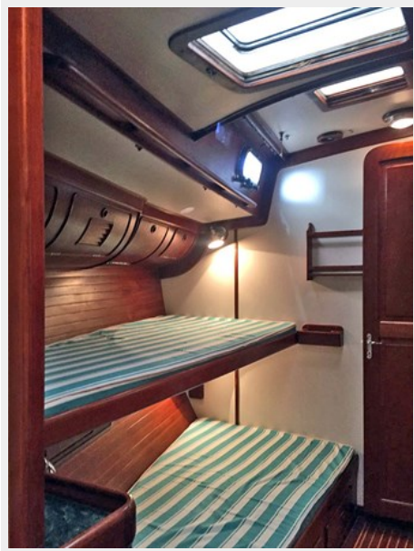
Stbd. Guest Cabin