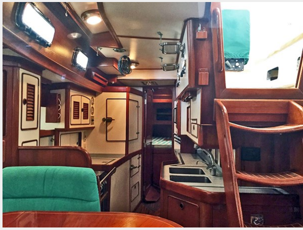
Salon Aft to Galley