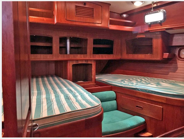
Owner's Cabin, Looking Aft