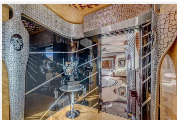
THUNDER 164' 1998/2021 Oceanfast Motor Yacht: Salon Entry Way