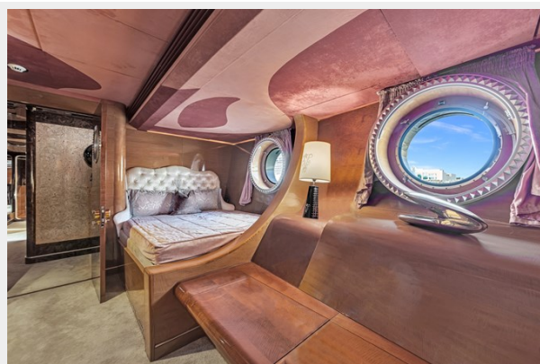
THUNDER 164' 1998/2021 Oceanfast Motor Yacht: Guest Stateroom Three