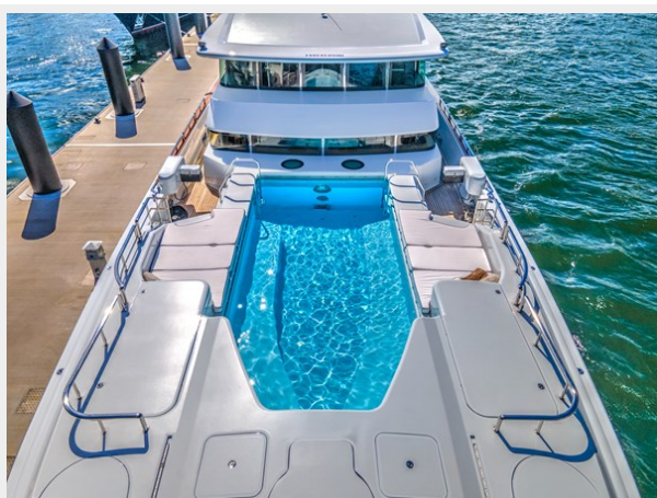
THUNDER 164' 1998/2021 Oceanfast Motor Yacht: Pool