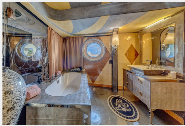
THUNDER 164' 1998/2021 Oceanfast Motor Yacht: Master Enuite