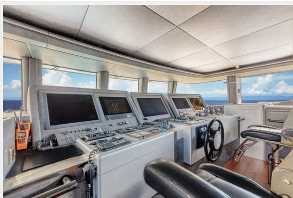
THUNDER 164' 1998/2021 Oceanfast Motor Yacht: Pilot House