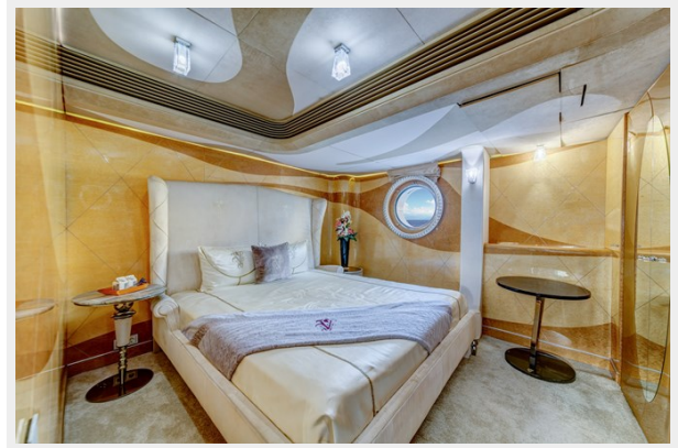
THUNDER 164' 1998/2021 Oceanfast Motor Yacht: Stateroom Two