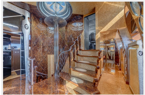
THUNDER 164' 1998/2021 Oceanfast Motor Yacht: Main Deck Landing