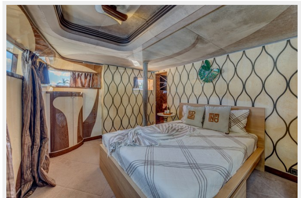
THUNDER 164' 1998/2021 Oceanfast Motor Yacht: Main Deck VIP