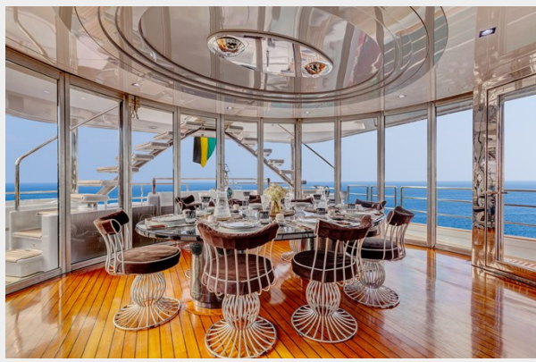
THUNDER 164' 1998/2021 Oceanfast Motor Yacht: Aft Dining