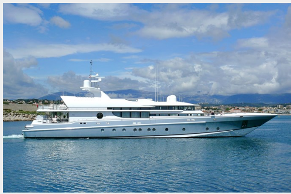
THUNDER 164' 1998/2021 Oceanfast Motor Yacht