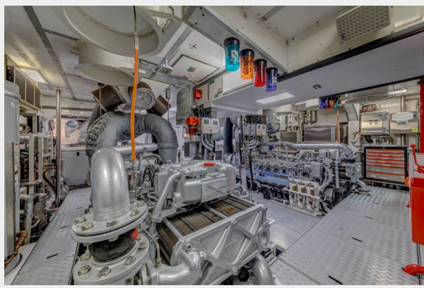
THUNDER 164' 1998/2021 Oceanfast Motor Yacht: Engine Room