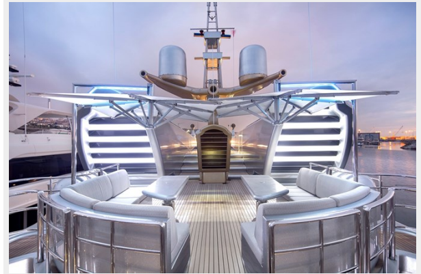
THUNDER 164' 1998/2021 Oceanfast Motor Yacht: Top Deck