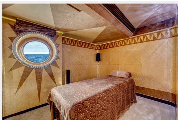
THUNDER 164' 1998/2021 Oceanfast Motor Yacht: Massage Room/Optional 6th Stateroom