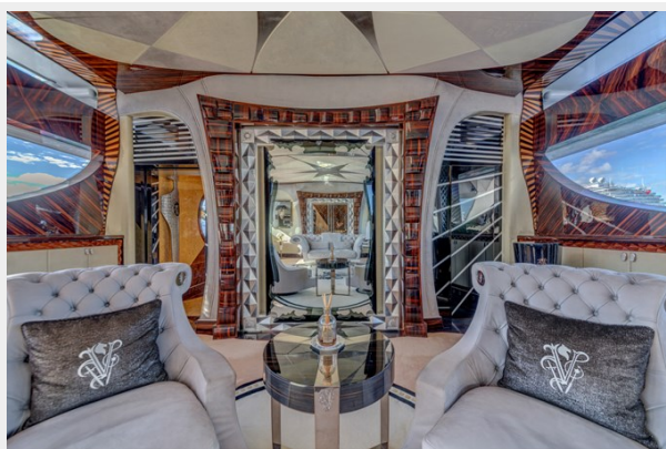
THUNDER 164' 1998/2021 Oceanfast Motor Yacht: Main Salon