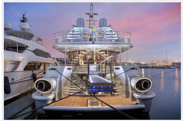
THUNDER 164' 1998/2021 Oceanfast Motor Yacht: Stern