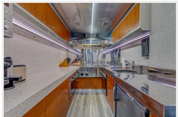
THUNDER 164' 1998/2021 Oceanfast Motor Yacht: Galley