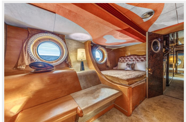
THUNDER 164' 1998/2021 Oceanfast Motor Yacht: Guest Stateroom Four