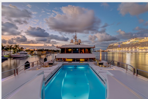
THUNDER 164' 1998/2021 Oceanfast Motor Yacht: Pool