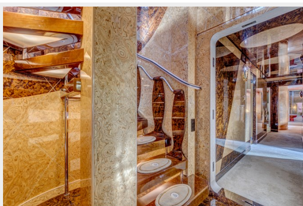
THUNDER 164' 1998/2021 Oceanfast Motor Yacht: Guest Landing