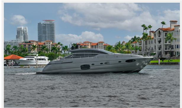
Exterior view/Starboard side