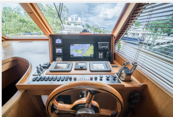
Mini Helm Station