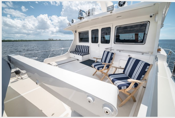
Upper Aft Deck facing Portside