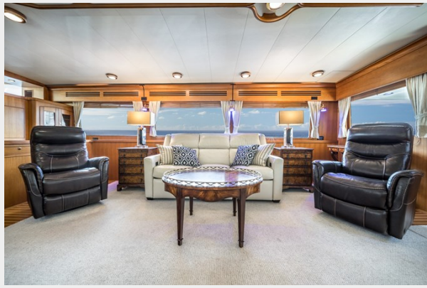
Salon facing Starboard