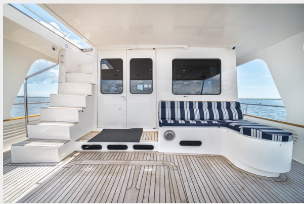
Aft Deck facing Forward