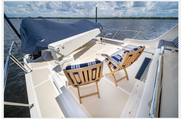
Upper Aft Deck