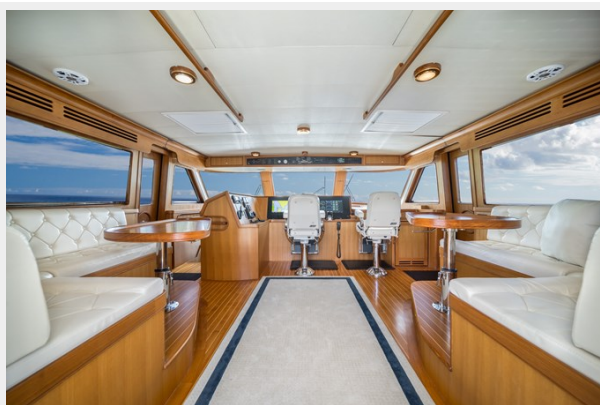
Commandbridge facing Forward