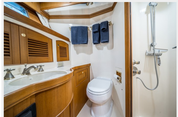
Portside Guest Head