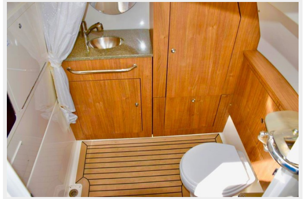
Under console head