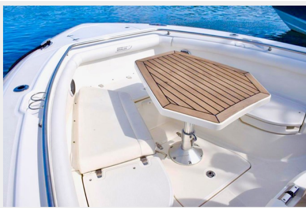
Forward seating with table raised