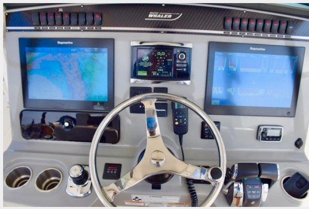
Electronics and Controls