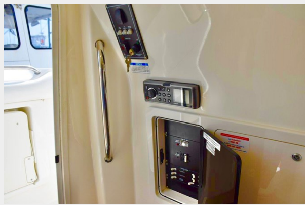
Electrical panel (110v AC)