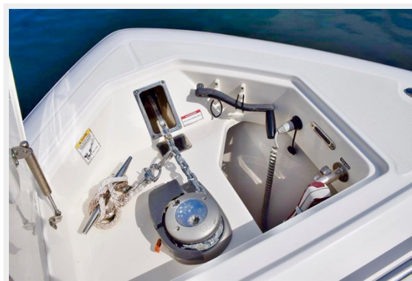
Windlass and anchor chute