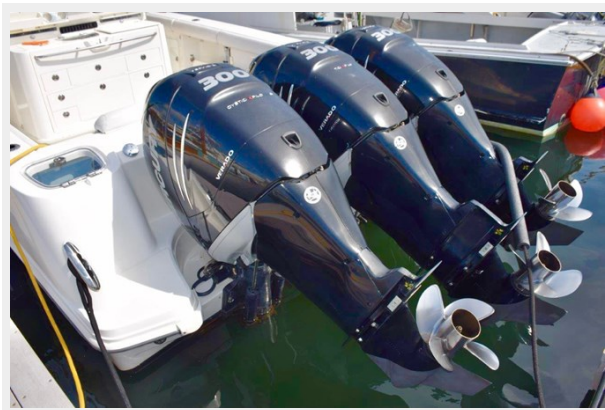
Triple 300hp Verados