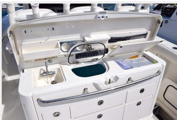
Rigging station and Livewell