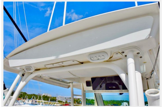
Electric retractable sunshade