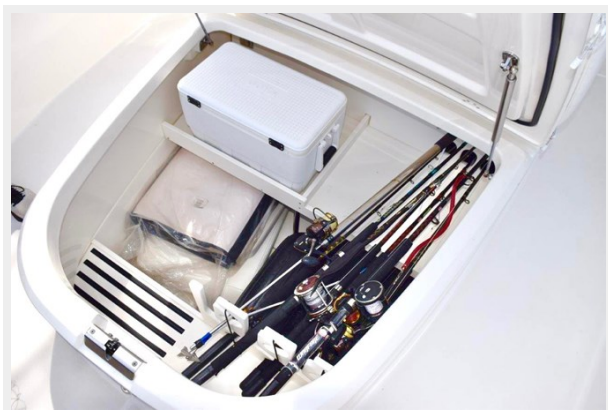
Storage under forward lounge