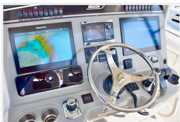
Raymarine Hybrid multifunction screens