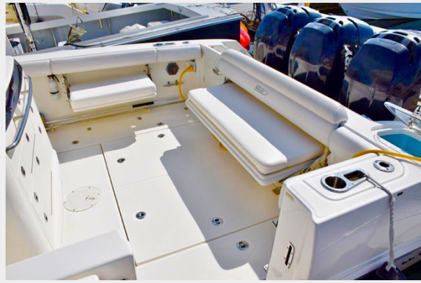
Cockpit fold down seating