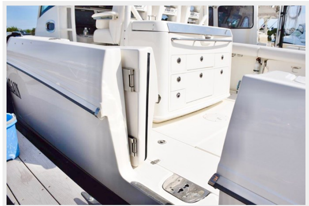
Dive door - boarding gate