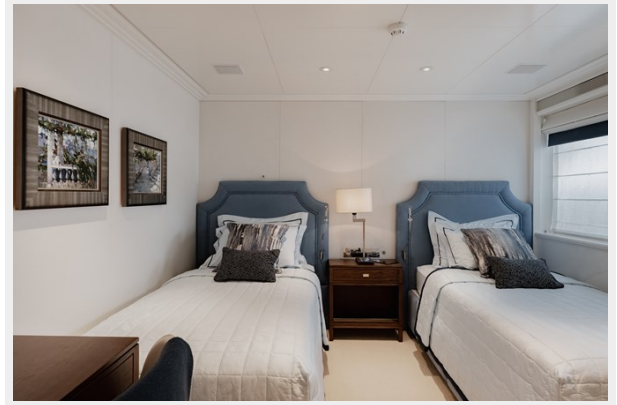
Twin guest cabin