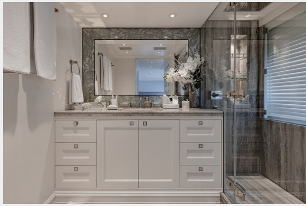
Main deck - VIP bathroom