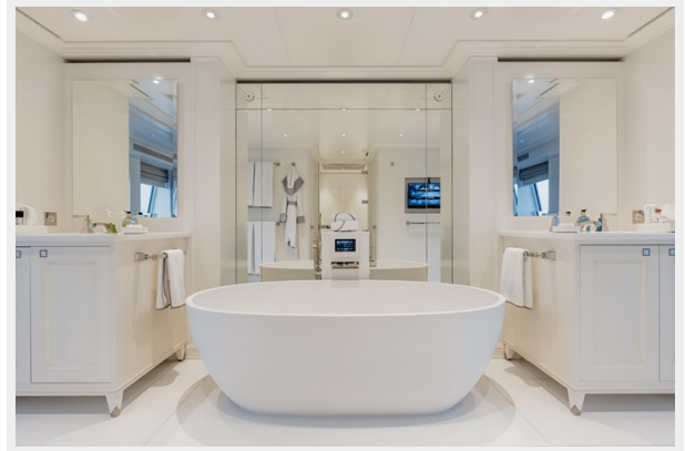
Upper deck - master bathroom