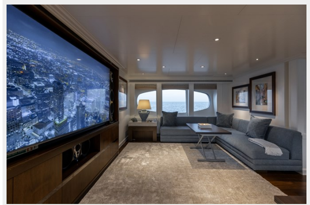
Owner's Study/Cinema Room