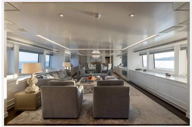
Main Deck Saloon