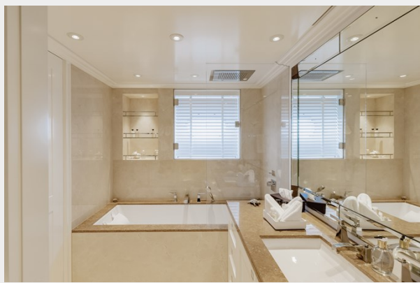
Double cabin bathroom