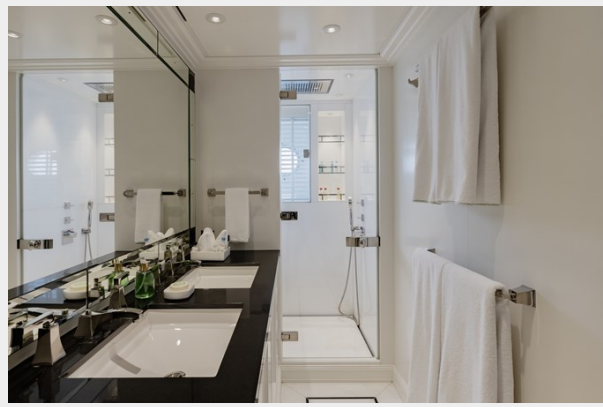
Double cabin bathroom 2