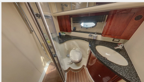
make my day phantom 50_guest head_extracted-picture