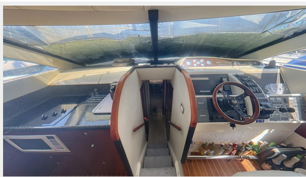
make my day phantom 50_wheelhouse_extracted-picture