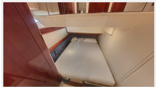
make my day phantom 50_stbd cabin_extracted-picture