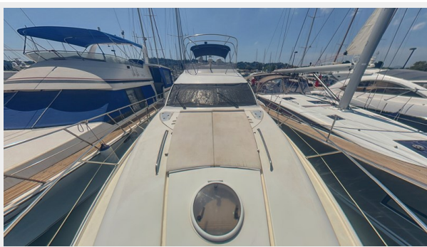
make my day phantom 50_fore_extracted-picture