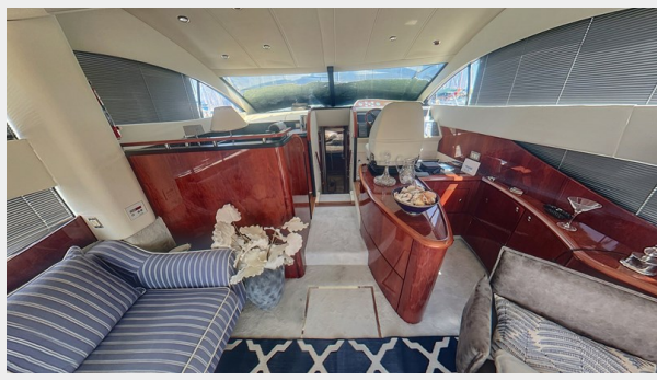
make my day phantom 50_saloon_extracted-picture (1)