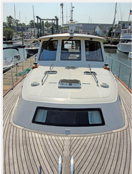
Cabin Trunk, Looking Aft