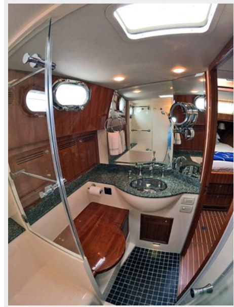
Owner's Head and Vanity from Shower