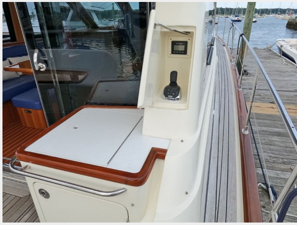
Docking Station, Aft Deck