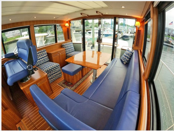
Salon Table Open