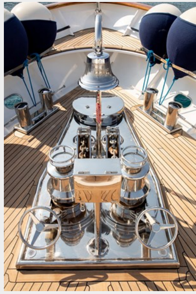
Bow Looking Forward