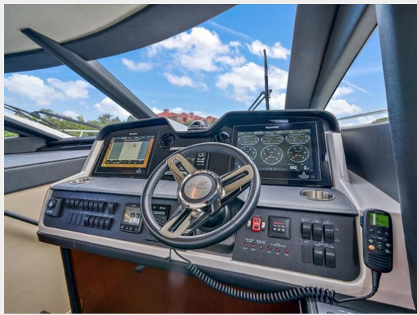
Lower Helm 2