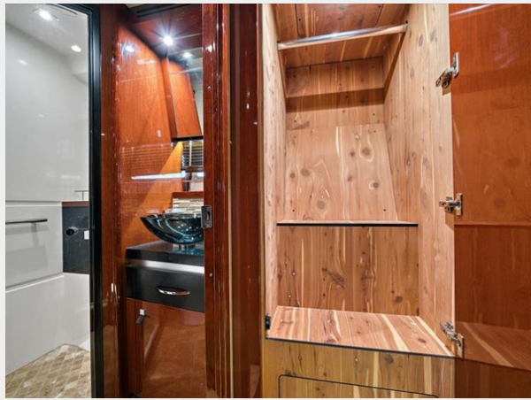
Bow/ STB Strm/ Day Head 2