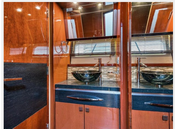
Master Head 2