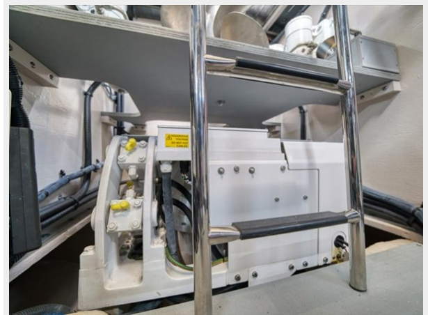
Engine Room 4