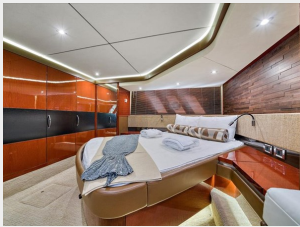
Master Stateroom 2