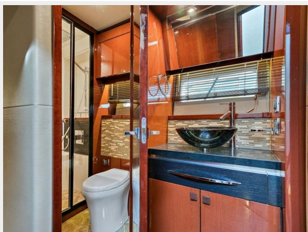
Master Head 3