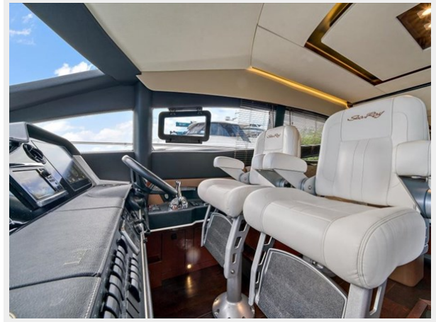
Lower Helm 1