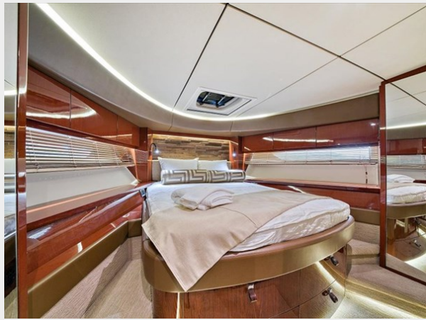
Bow VIP Stateroom 1