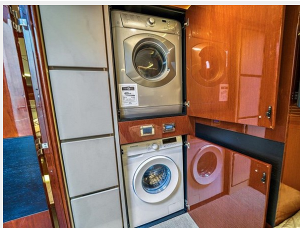
Washer Dryer/ STB Stateroom