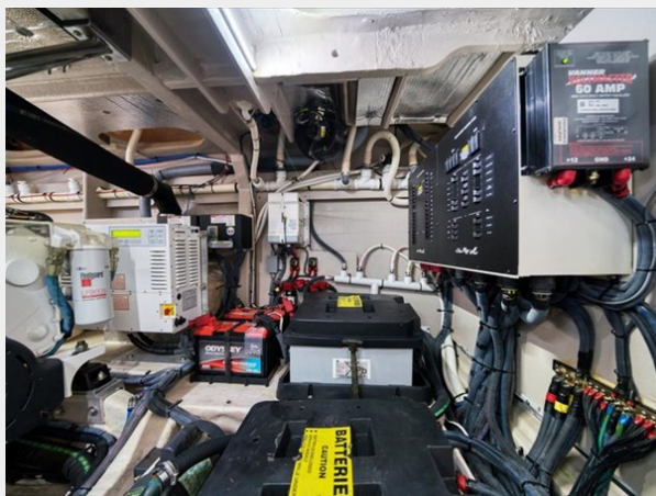
Engine Room 3