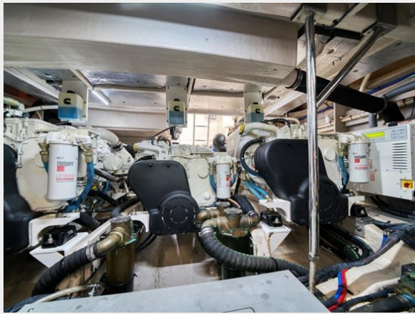
Engine Room 1