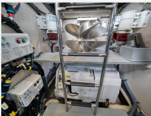
SeaKeeper 16 Gyro and Spare Props