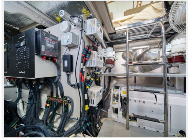
Engine Room 2