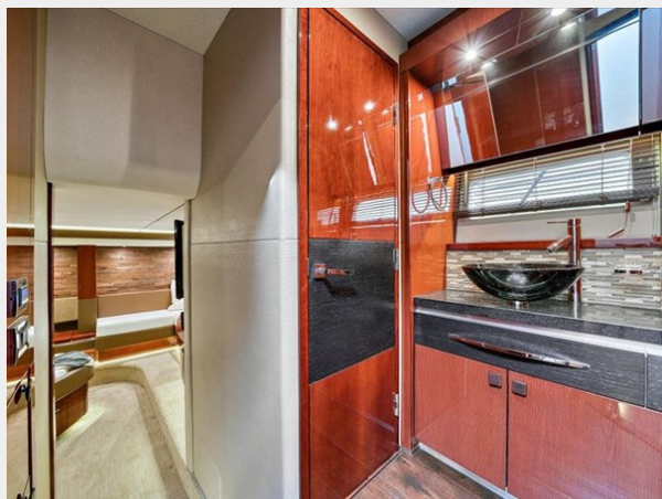
Master Head 1