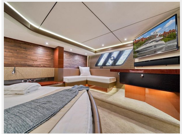
Master Stateroom 3