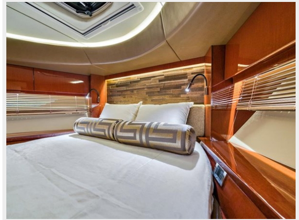
Bow VIP Stateroom 2