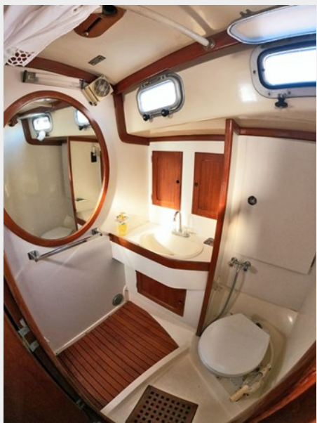
Head and Shower, Looking Aft