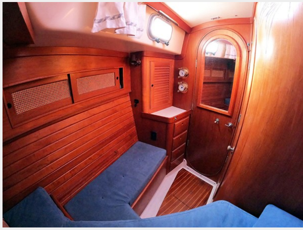
Fwd. Cabin Settee