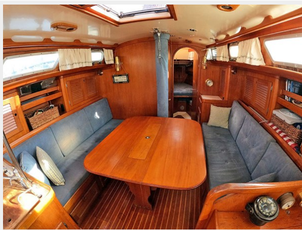
Drop-leaf Table, Extended