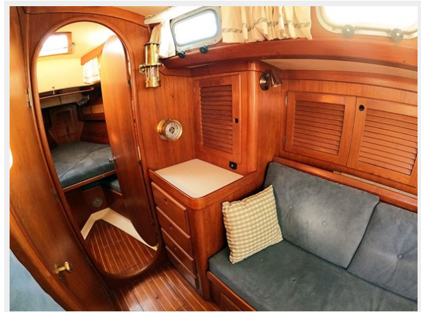
Salon Hanging Locker and Drawers