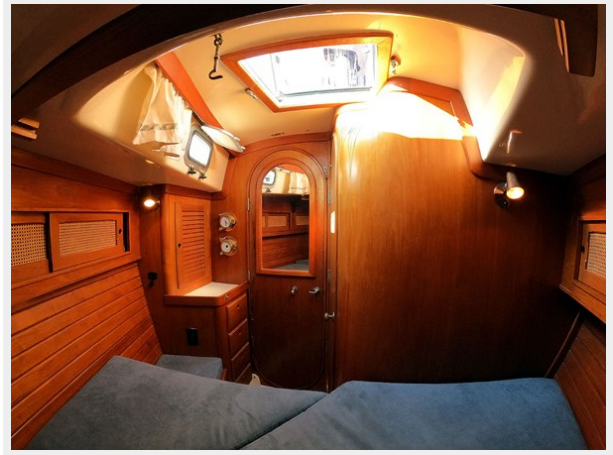
Fwd. Cabin, Overhead