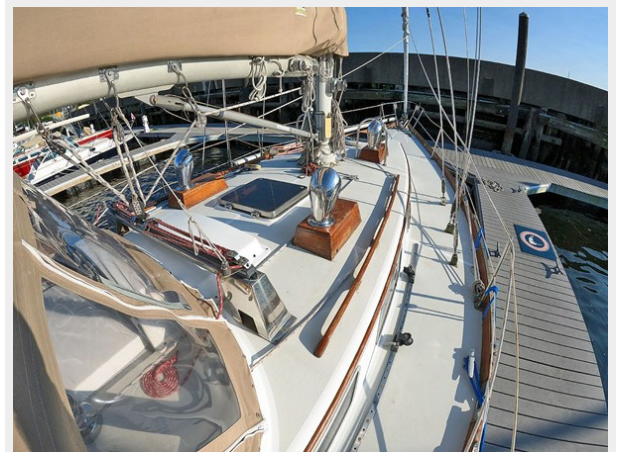
Deck, Looking Fwd.