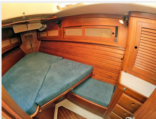
Fwd. Berth with Filler