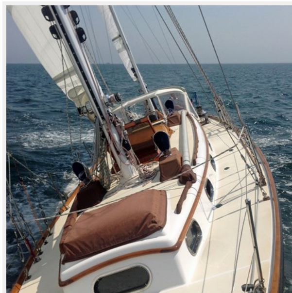
Sailing, Looking Aft