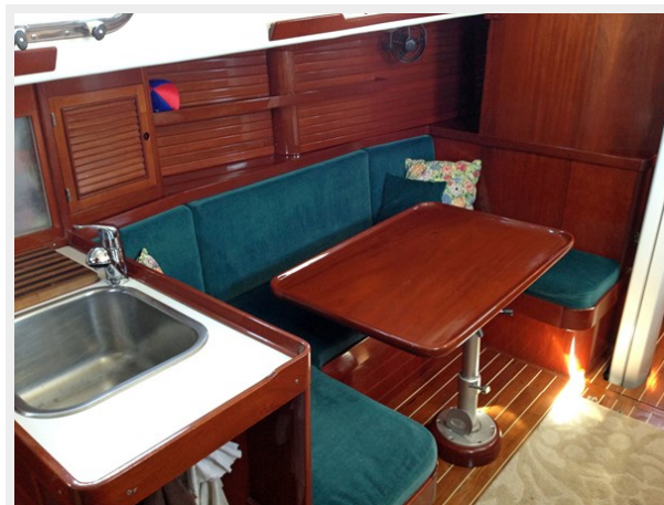
Salon to Port