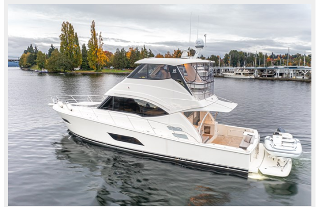
Boat 2 Riviera 11L