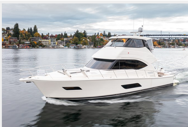
Boat 2 Riviera 08L