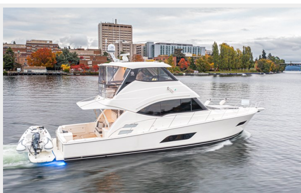
Boat 2 Riviera 10L