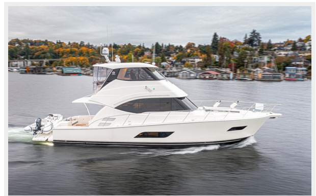
Boat 2 Riviera 16L