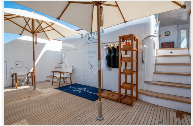
36 - Beach platform