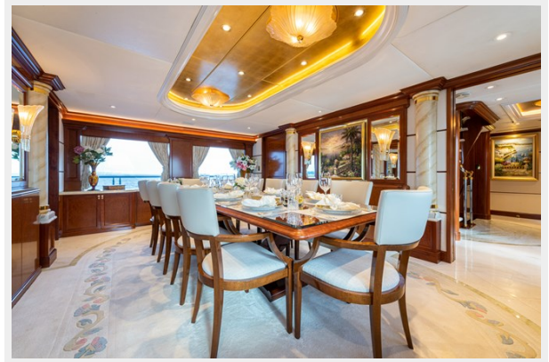
13 - Dining