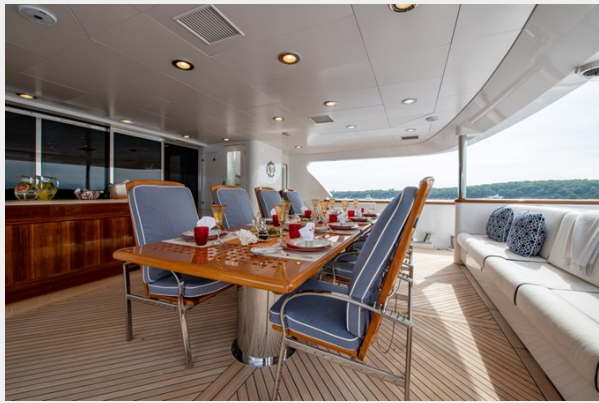
35a - Outdoor dining day