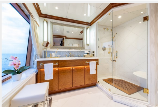
20 - Owner Shower