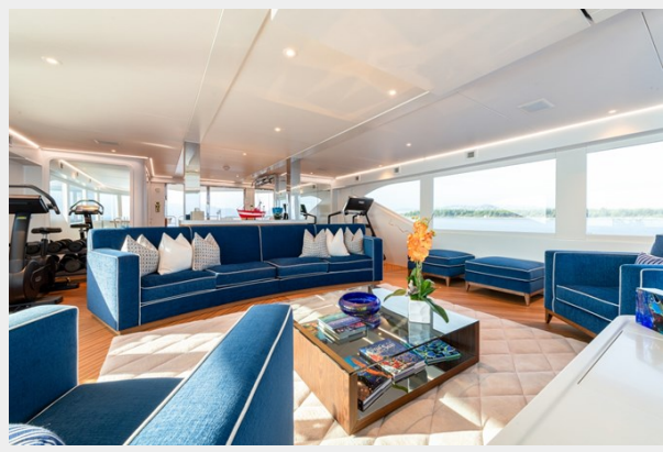
2 - Upper Salon 2