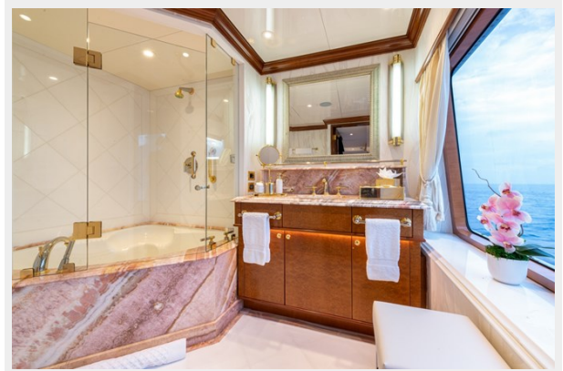
19 - Owner bathroom