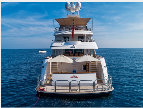
38 - Aft - umbrellas up