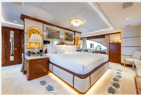
14 - Owner Cabin