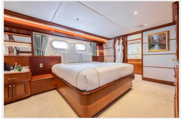
21 - Double Cabin 3