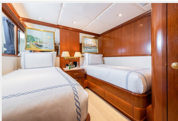
24 - Twin Cabin 2