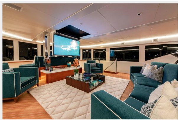
4 - Upper Salon movie