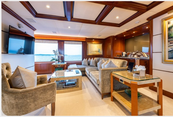
20b - Owner lounge