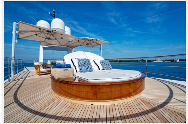
28 - Skydeck 2