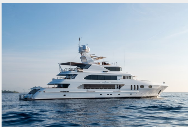
48 - Still port