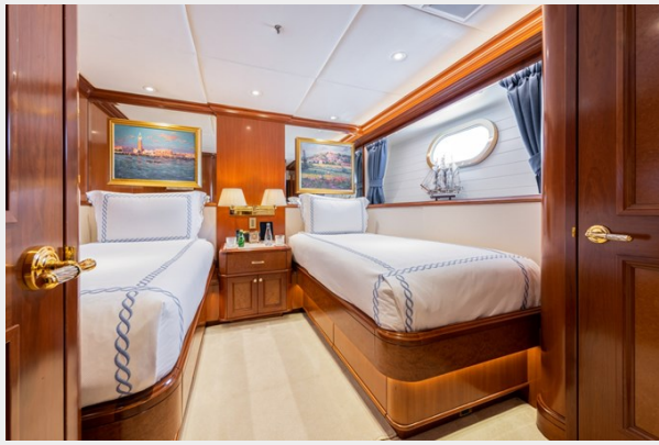
26 -Twin Cabin