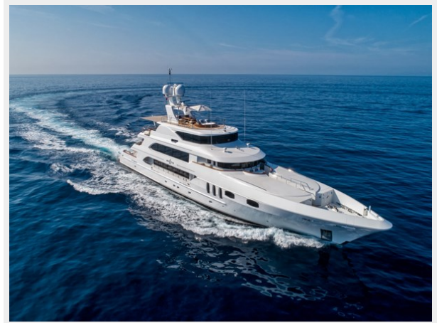
44 - Running starboard