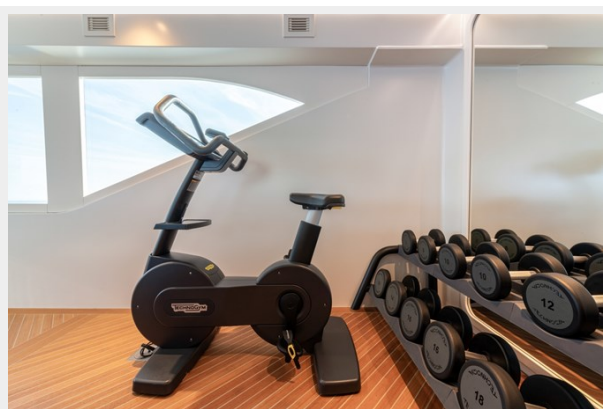
6 - Gym detail - bicycle