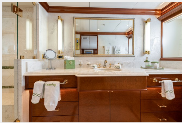
22 - Bathroom tbc - green piping