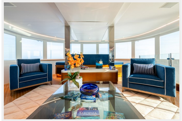
3 - Upper Salon 7