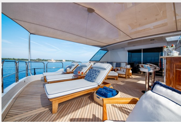
33 - Sundeck loungers detail 2