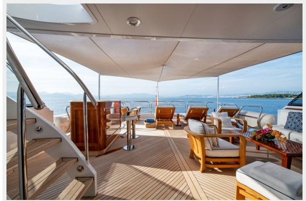
31 - Sundeck