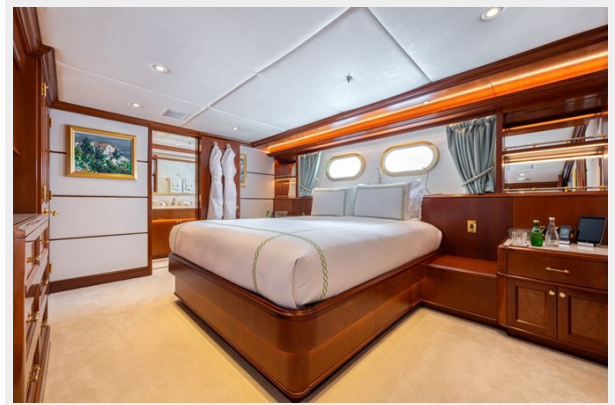
23 - Double Cabin