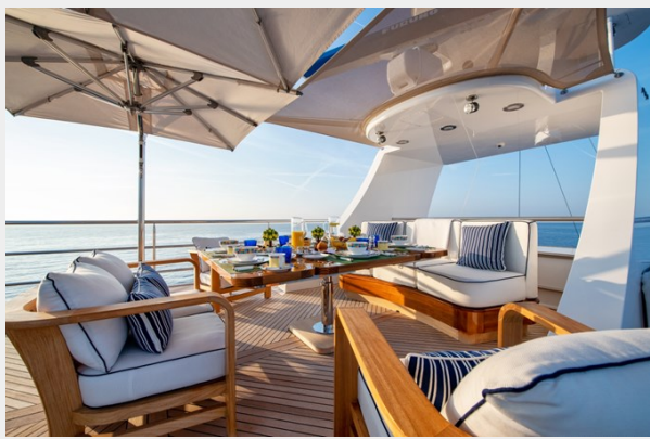
30 - Outdoor dining tbc