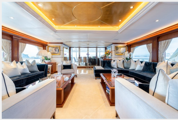
10 - Main Salon 7