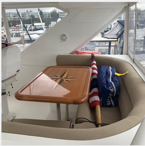
008 - Flybridge