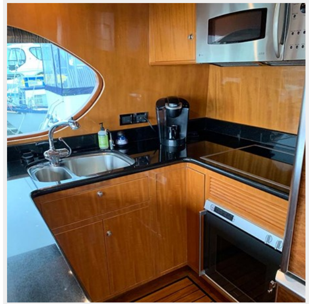
018 - Galley