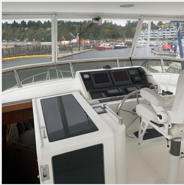
011 - Flybridge