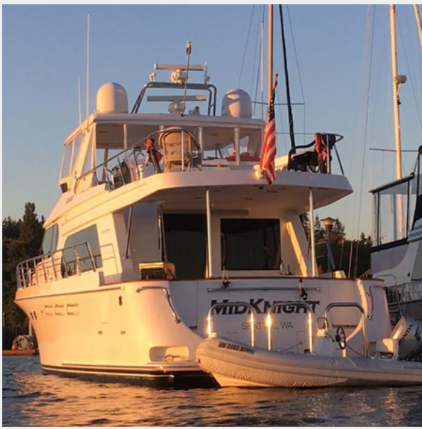
027 - Exterior, Aft