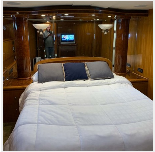
022 - Master Stateroom