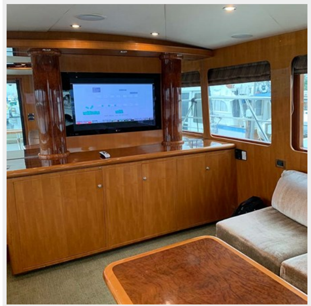
014 - Salon, Looking Forward