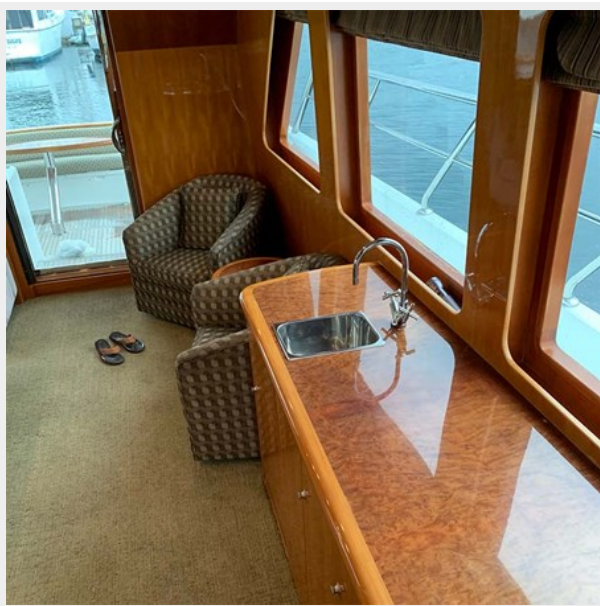
017 - Salon Bar Counter