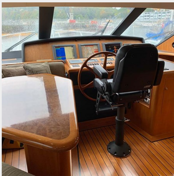
019 - Lower Helm