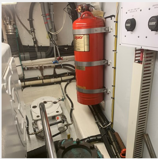
003 - Engine Room