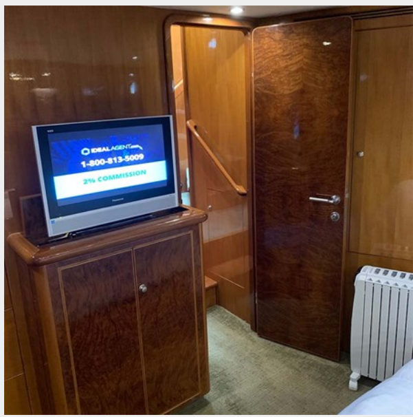
025 - Master Stateroom