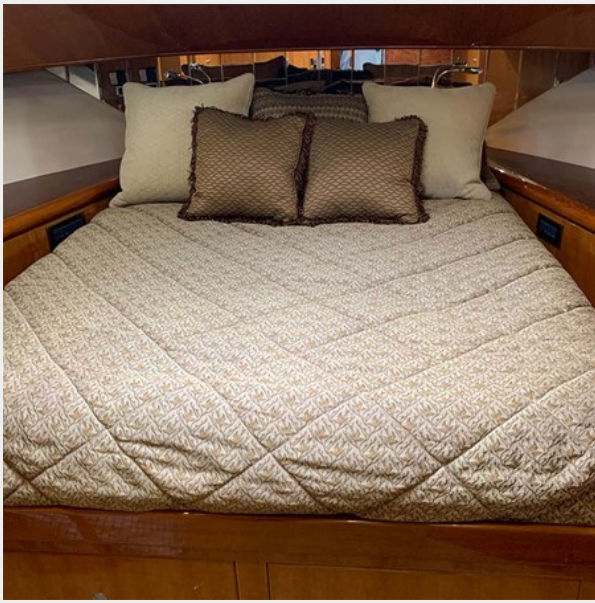
023 - Forward Stateroom