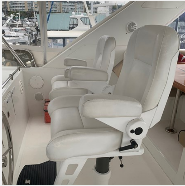
010 - Flybridge