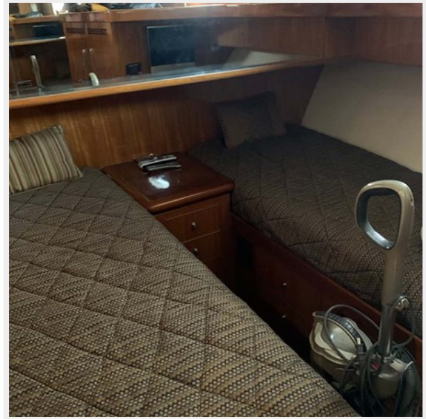
026 - Guest Stateroom