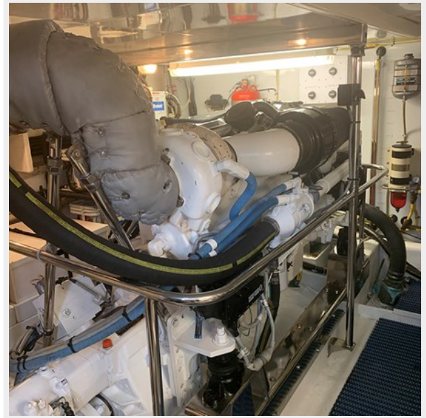
002 - Engine Room