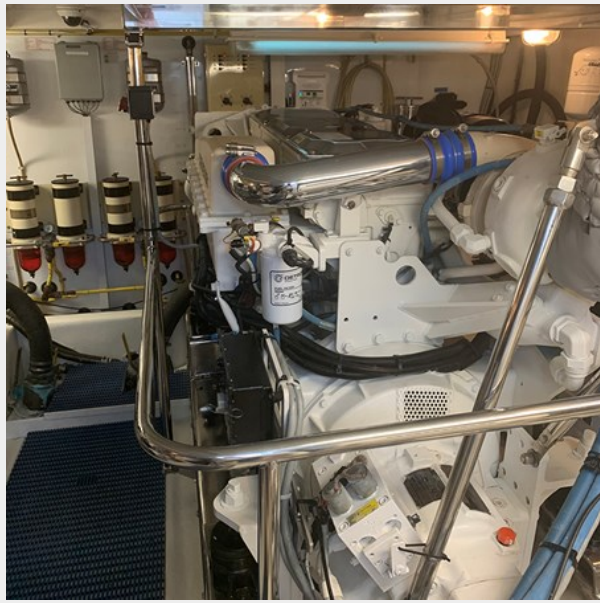
001 - Engine Room