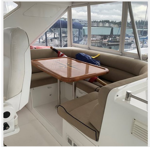
007 - Flybridge